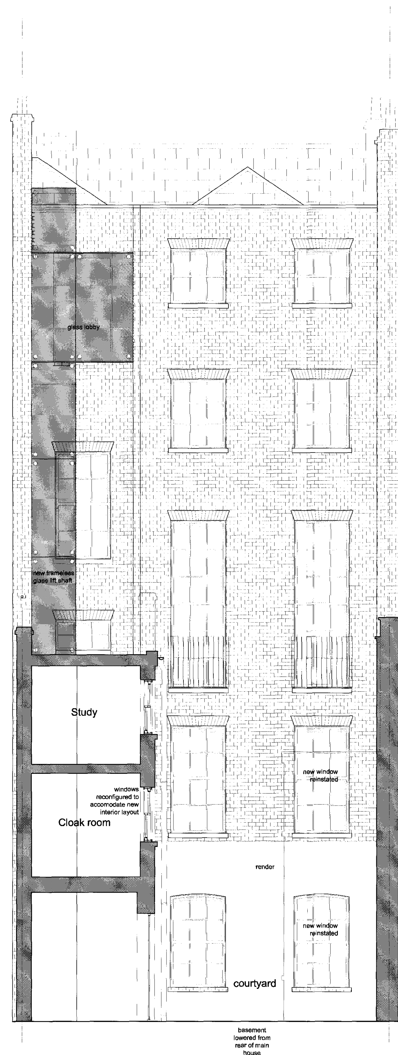
Proposed Rear Elevation Main Building