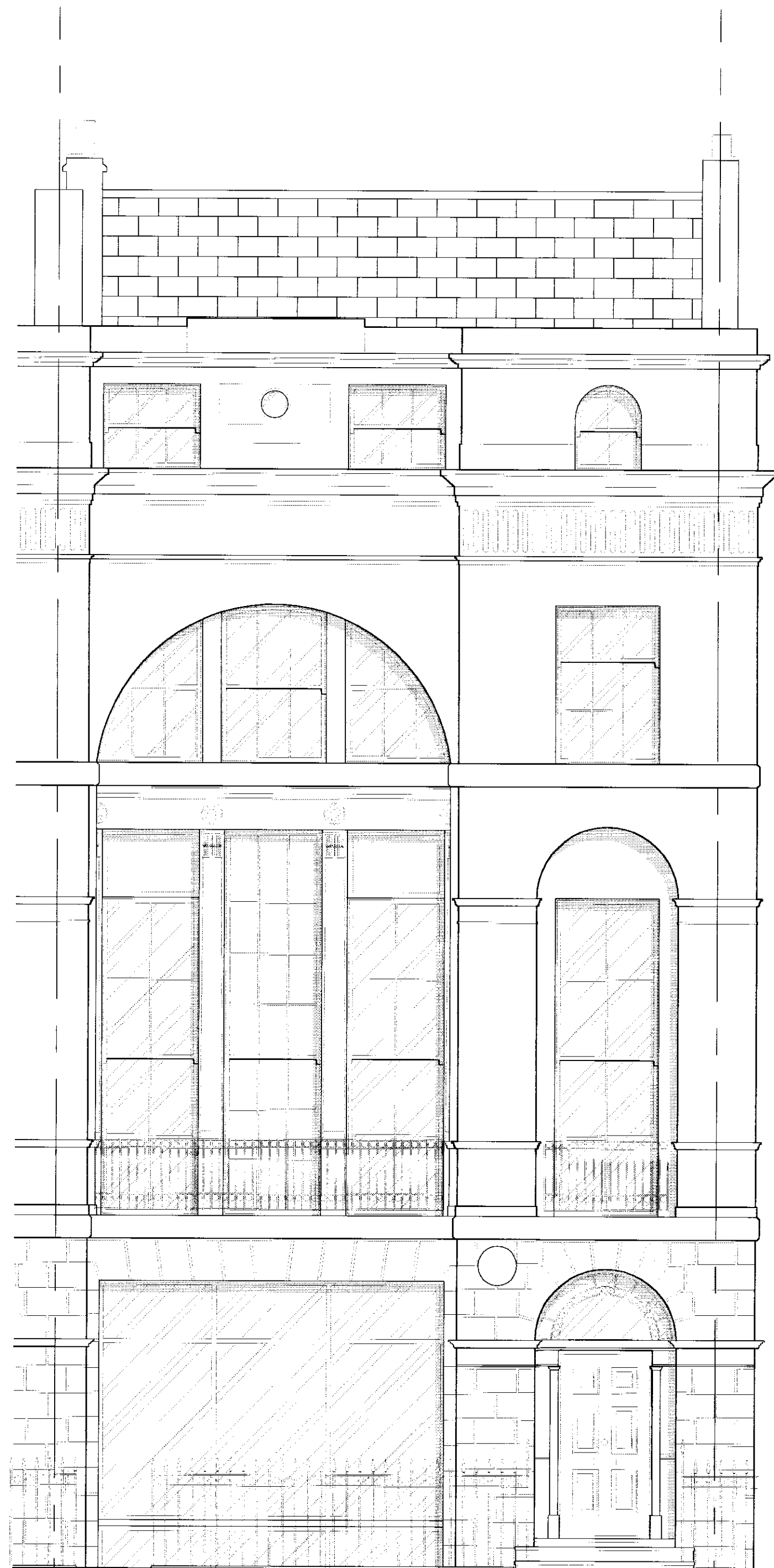
Existing Front Elevation Main Building

USE FIGURED DIMENSIONS ONLY DO NOT SCALE FROM THIS DRAWING ALL DIMENSIONS MUST BE CHECKED ON SITE AND INCONSISTENCIES MUST BE REPORTED BACK TO THE ARCHITECT THIS DRAWING AND ANY DESIGNS INDICATED THEREON ARE THE COPYRIGHT OF BROOKS / MURRAY ARCHITECTS ALL RIGHTS ARE RESERVED NO PART OF THIS WORK MAY BE PRODUCED WITHOUT PRIOR PERMISSION IN WRITING FROM BROOKS / MURRAY ARCHITECTS