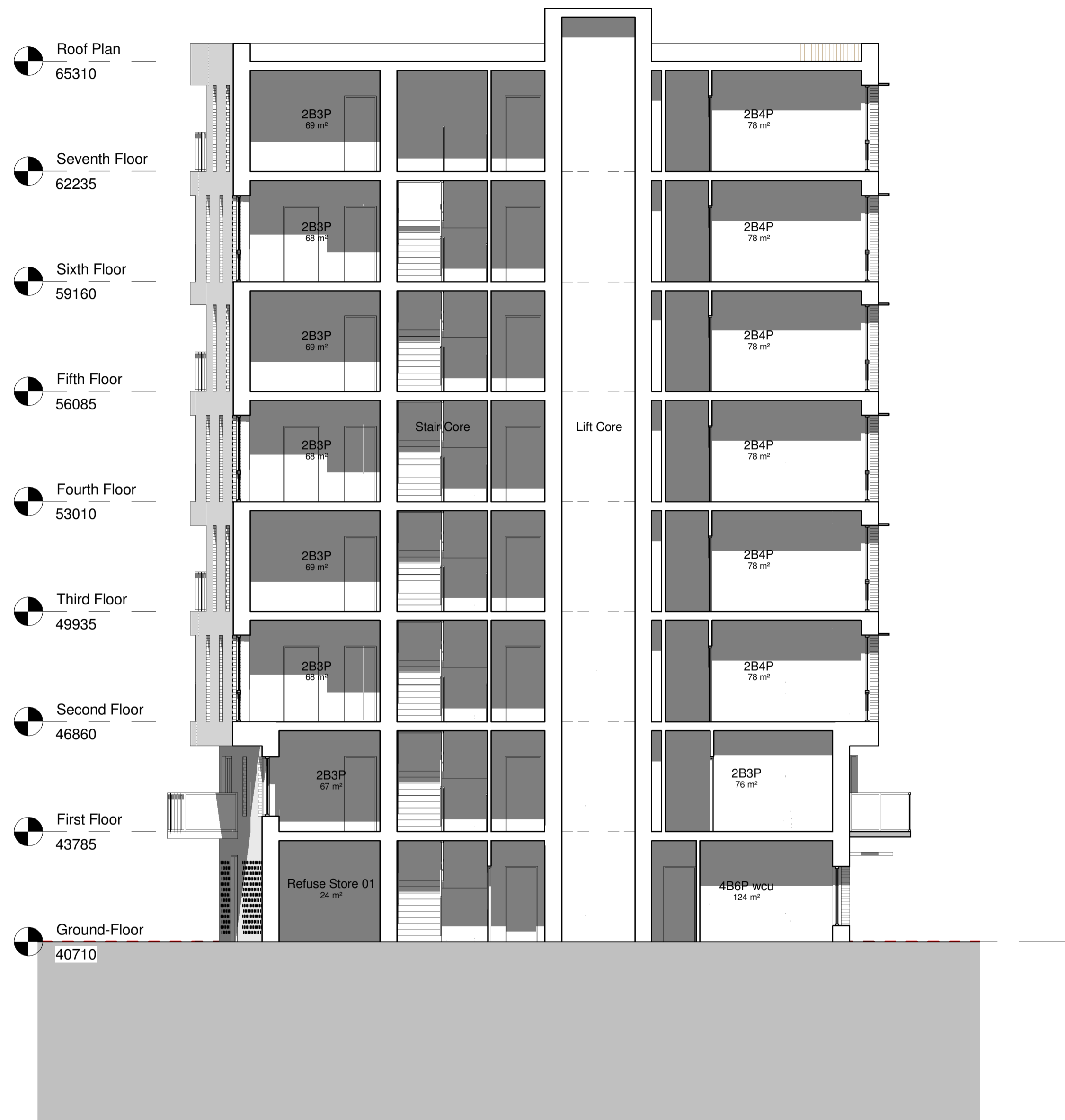
1 Section CC 1 : 100