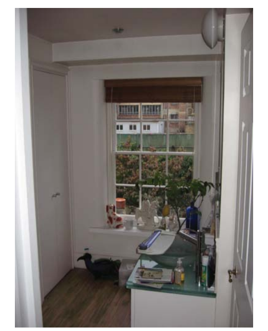
SECOND FLOOR BATHROOM: window to REAR COURTYARD