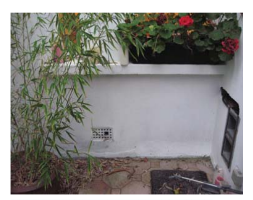
REAR ELEVATION facing south-east: existing window cill levels VIEW TO EXISTING LIVING ROOM looking north-west