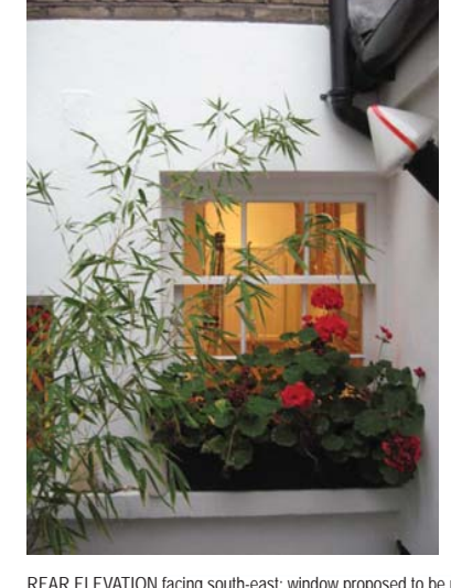
REAR ELEVATION facing south-east: window proposed to be made into internal door opening