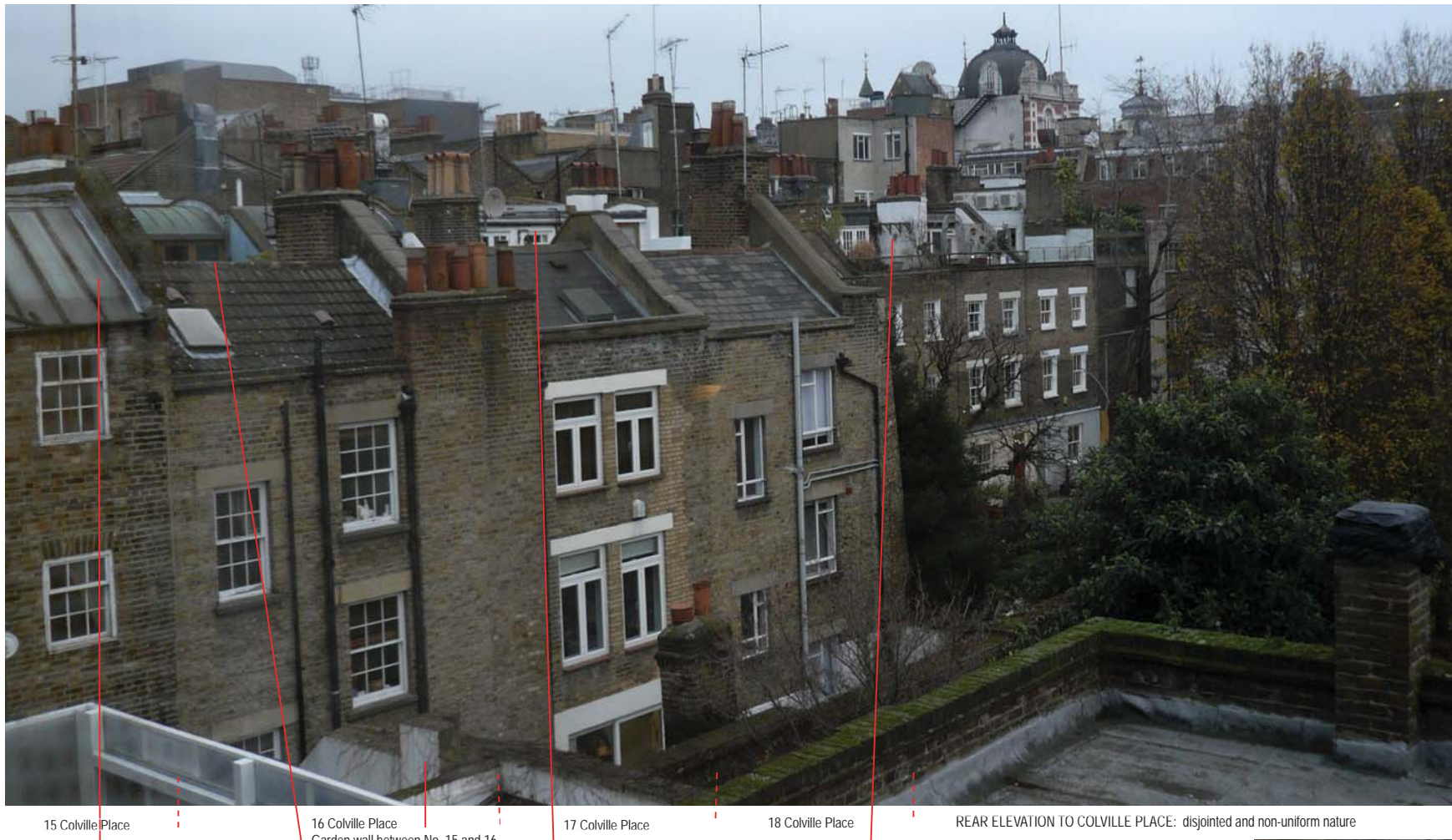
16 Colville Place Garden wall between No. 15 and 16 hides ground floor windows and kitchen extension

Do not scale off this drawing. All dimensions to be checked on site