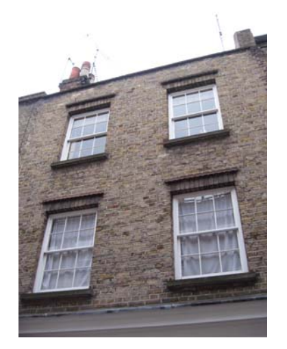
16 COLVILLE PLACE: North-West Facing Elevation

17 COLVILLE PLACE: North-West Facing Elevation