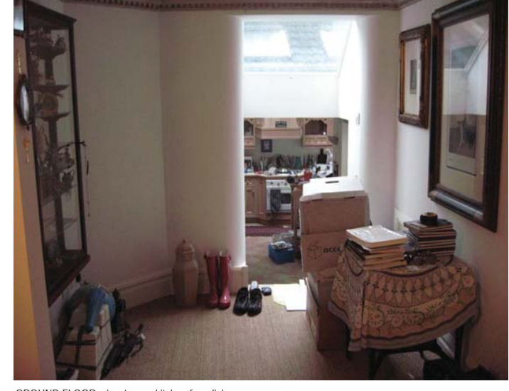
GROUND FLOOR: view to rear kitchen from living room