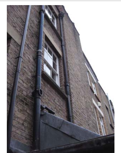
REAR ELEVATION facing south-east & existing rooflight over kitchen extension