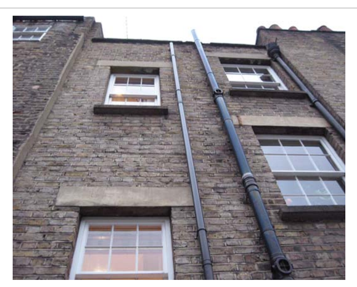
REAR ELEVATION: to courtyard facing south-east