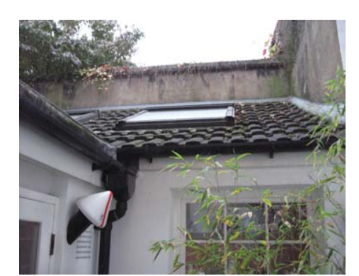
REAR KITCHEN EXTENSION ROOF looking south-east