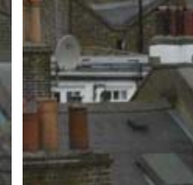
Roof terraces evident to front elevation of opposite side of Colville Place