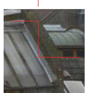
Raised ridge level