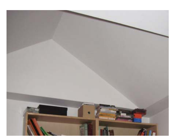
SECOND FLOOR BEDROOM: raised ceiling level into roof void