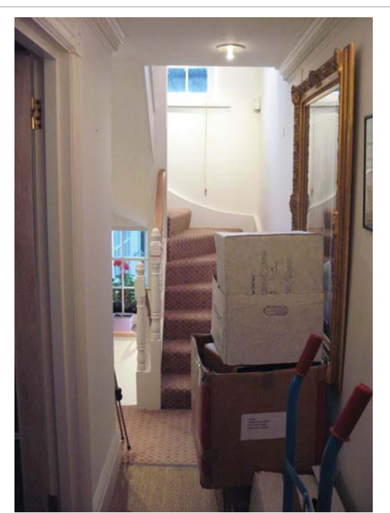
GROUND FLOOR: view to main staircase