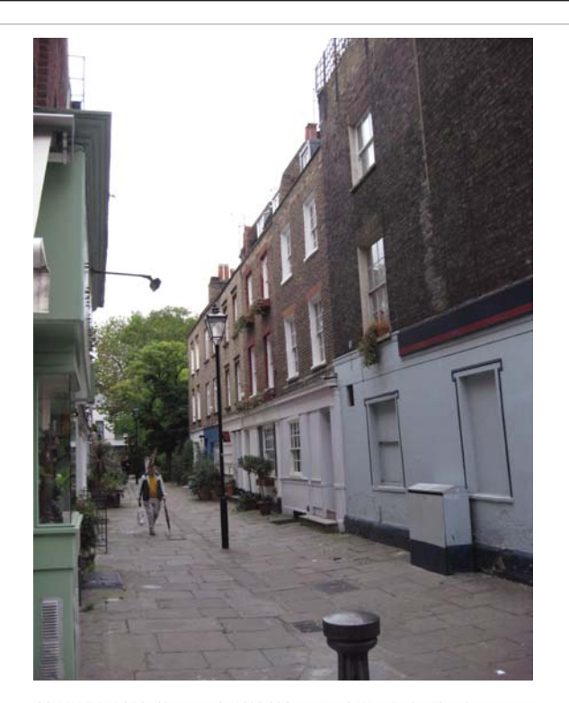
COLVILLE PLACE looking towards Whitfield Street: North-West Facing Elevation

15-18 COLVILLE PLACE: North-West Facing Elevation