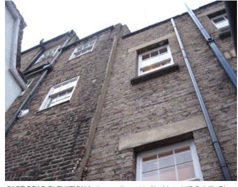
PART REAR ELEVATION facing south-east to No.16 and 15 Colville PI