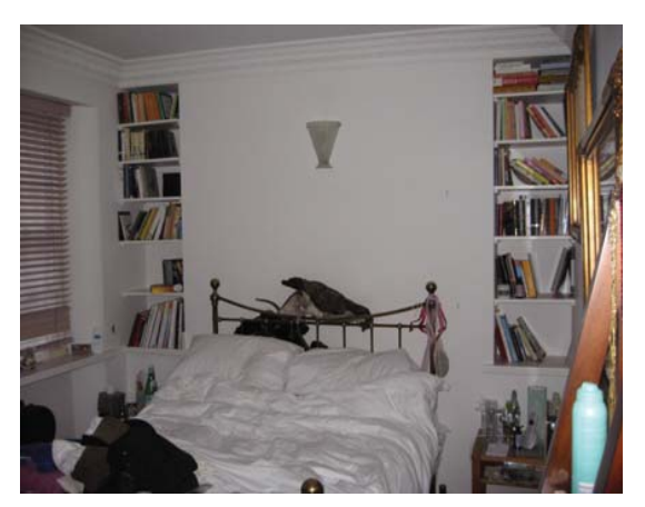
FIRST FLOOR BEDROOM