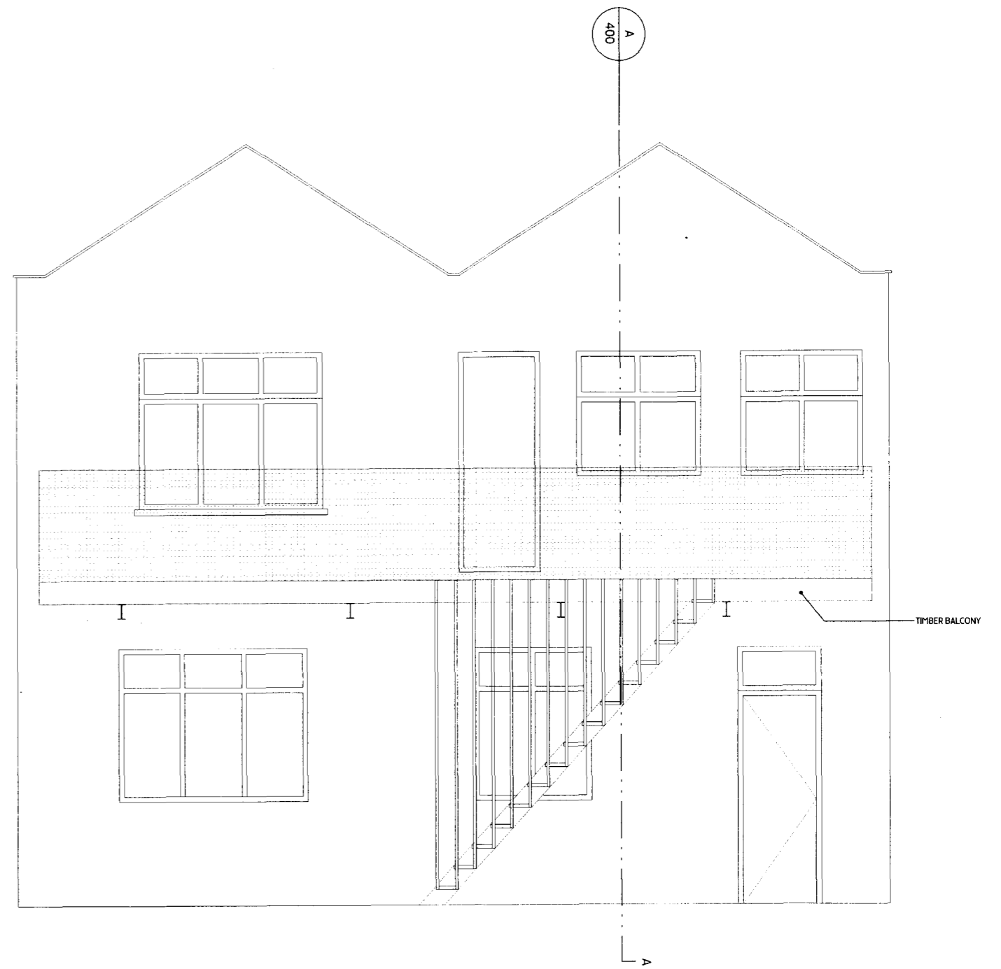
02 EXISTING REAR ELEVATION