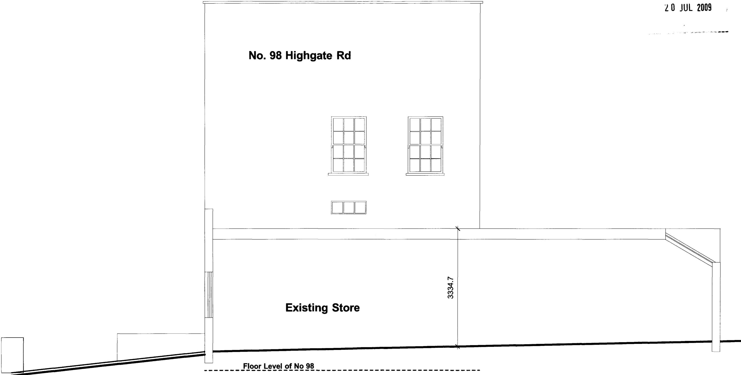
EXISTING FRONT SECTION AA 1:50 @: A3