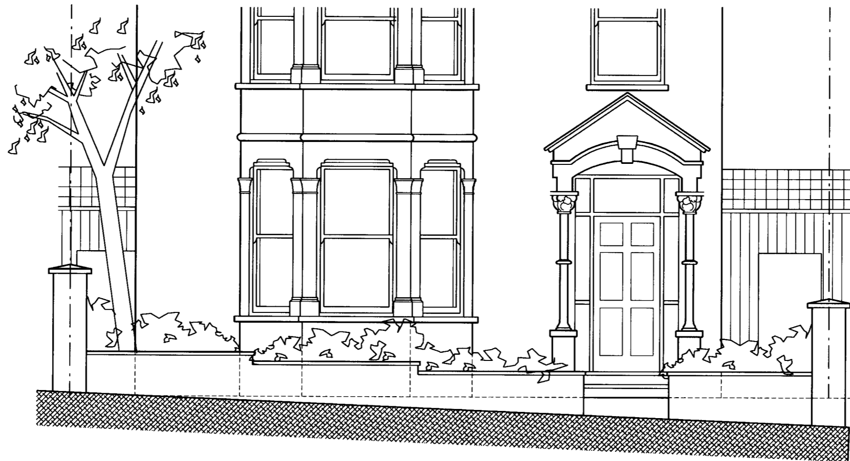
FRONT ELEVATION - in true elevation (UNCHANGED)