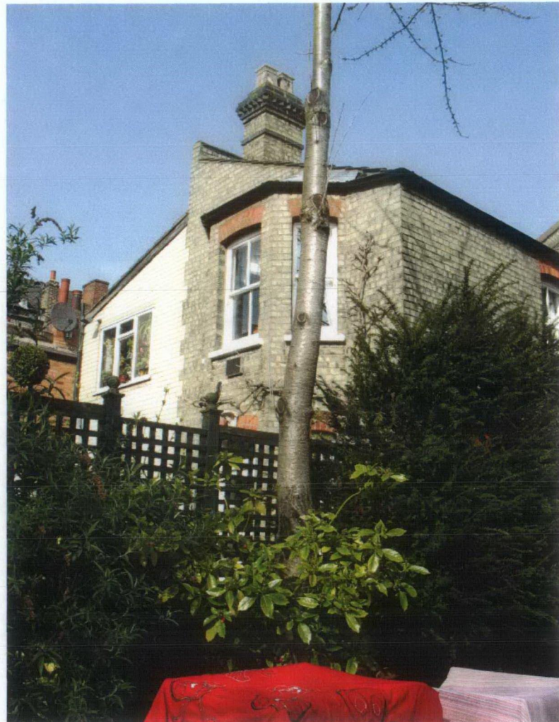
Rear view of no.7