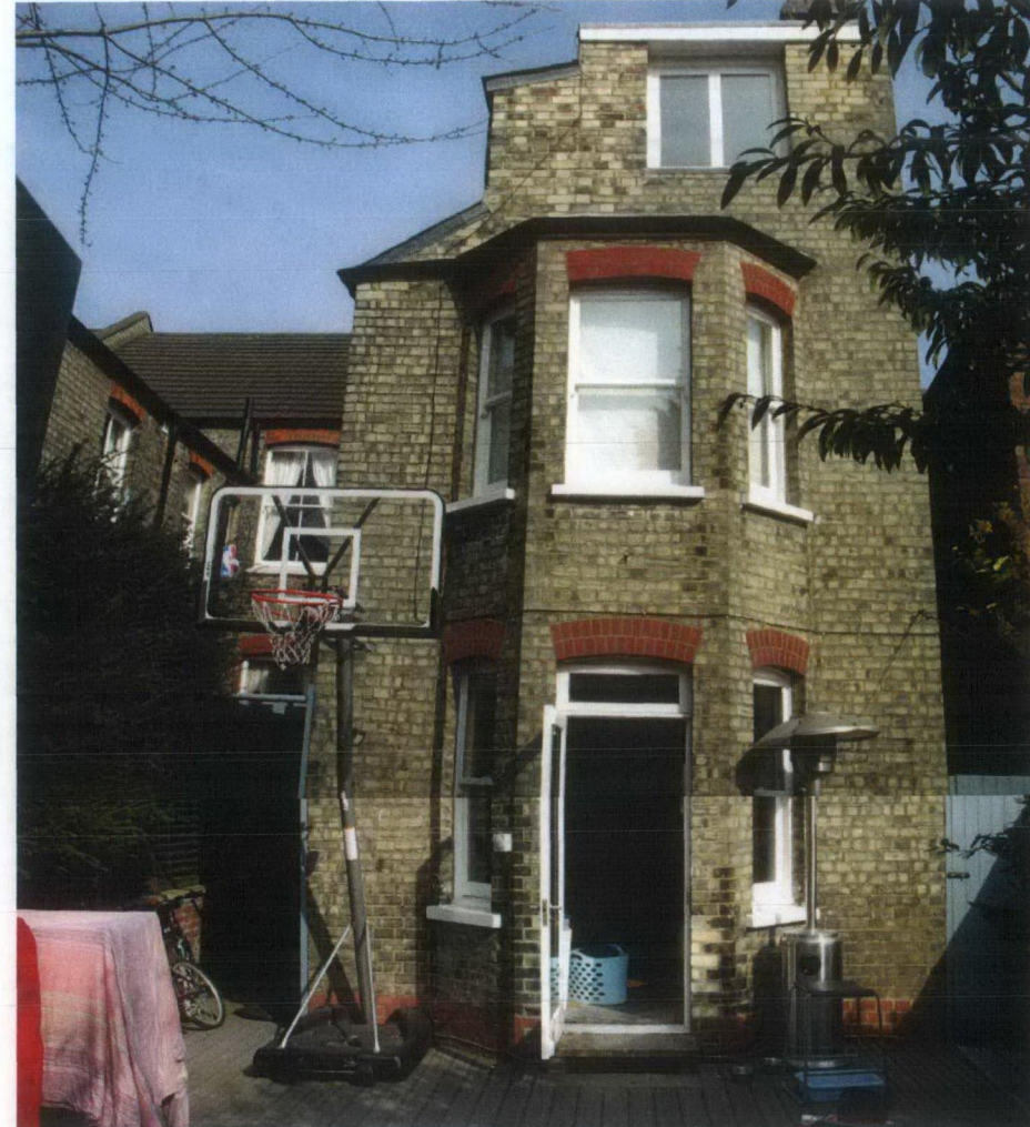
Rear view of no.9