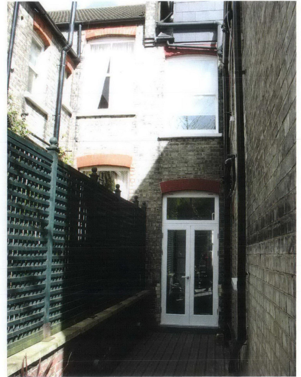
boundary fence between no.7 and no.9