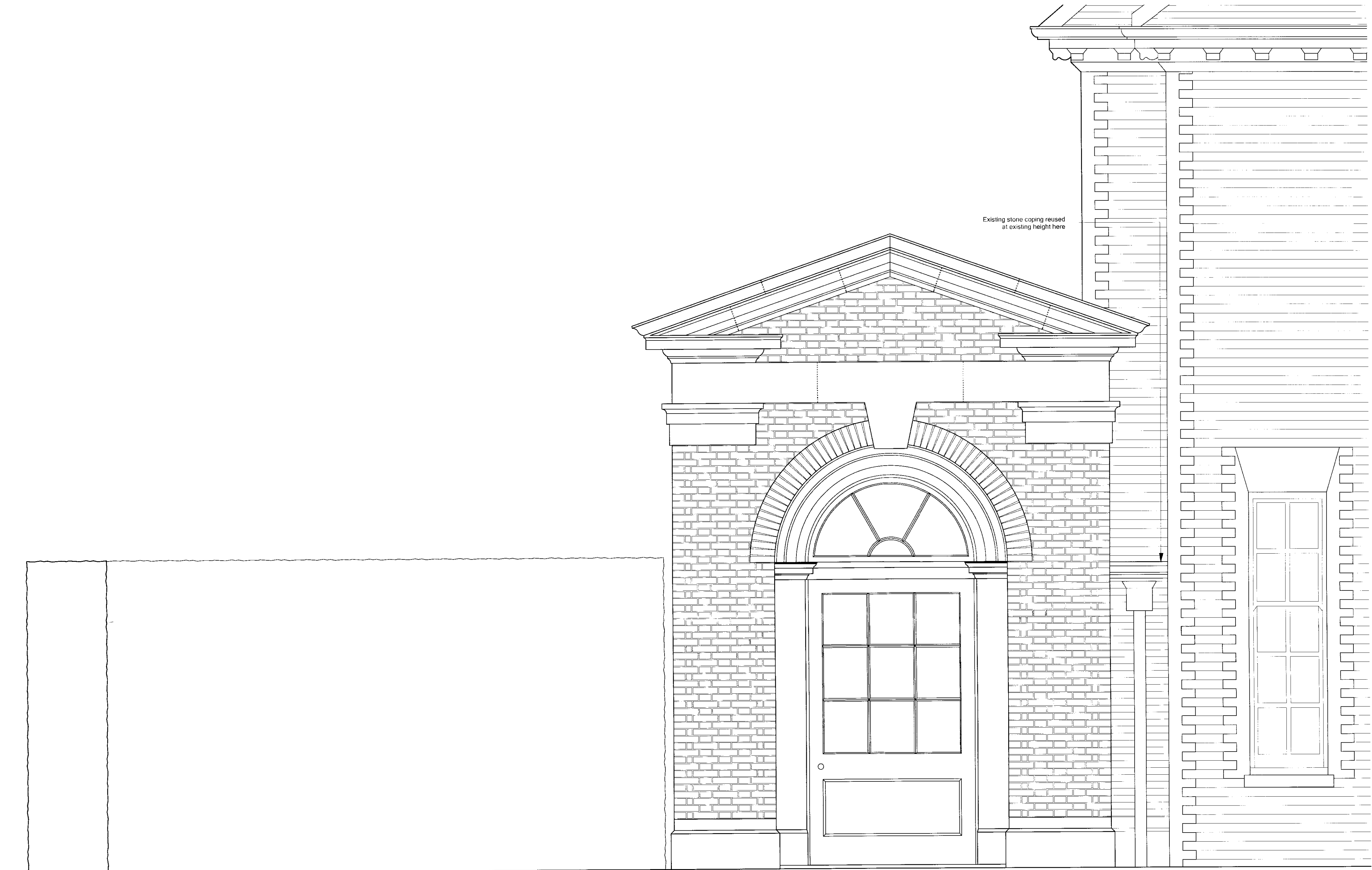
Proposed Detail of East Elevation of South-West Lodge & House (Elevation H)