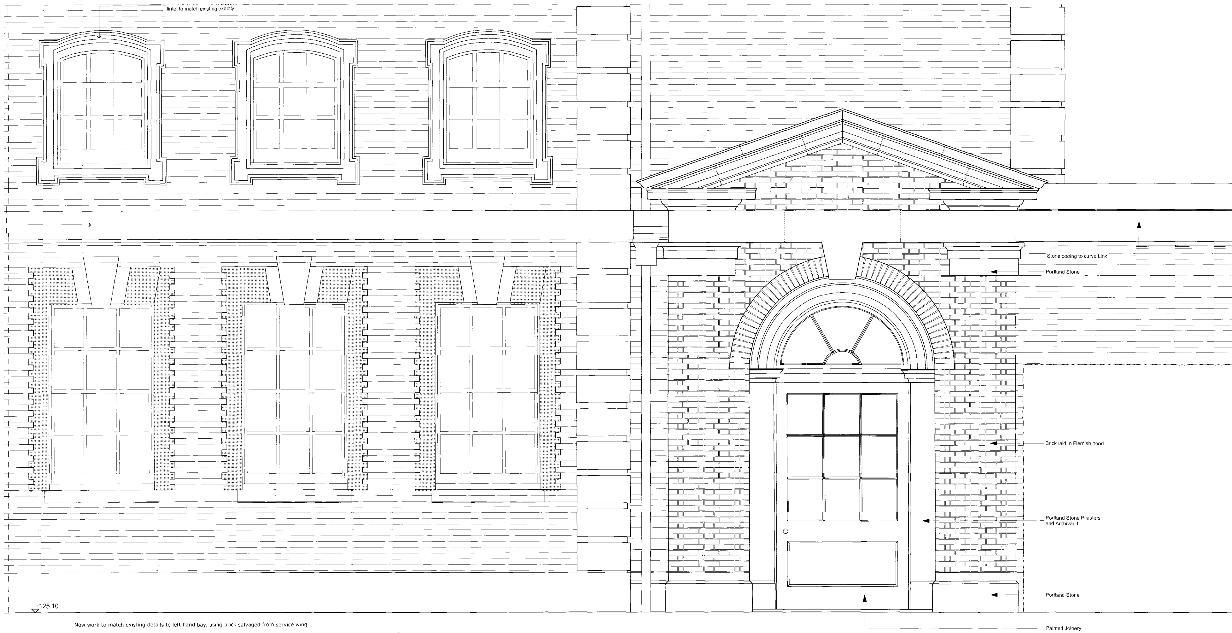
Proposed Detail of East Elevation of North-West Lodge & House (Elevation G)

Adjacent Properties and Boundaries are shown for illustrative purposes only and have not been surveyed unless otherwise stated. All areas shown are approximate and should be verified before forming the basis of a decision. Do not scale other than for Planning Application purposes. All dimensions must be checked by the contractor before commencing work on site. No deviation from this drawing will be permitted without the prior written consent of the Architect. The copyright of this drawing remains with the Architect and may not be reproduced in any form without prior written consent. Ground Floor Slabs, Foundations, Sub-Structures, etc. All work below ground level is shown provisionally. Inspection of ground condition is essential prior to work commencing. Reassessment is essential when the ground conditions are apparent, and redesign may be necessary in the light of soil conditions found. The responsibility for establishing the soil and sub-soil conditions rests with the contractor.