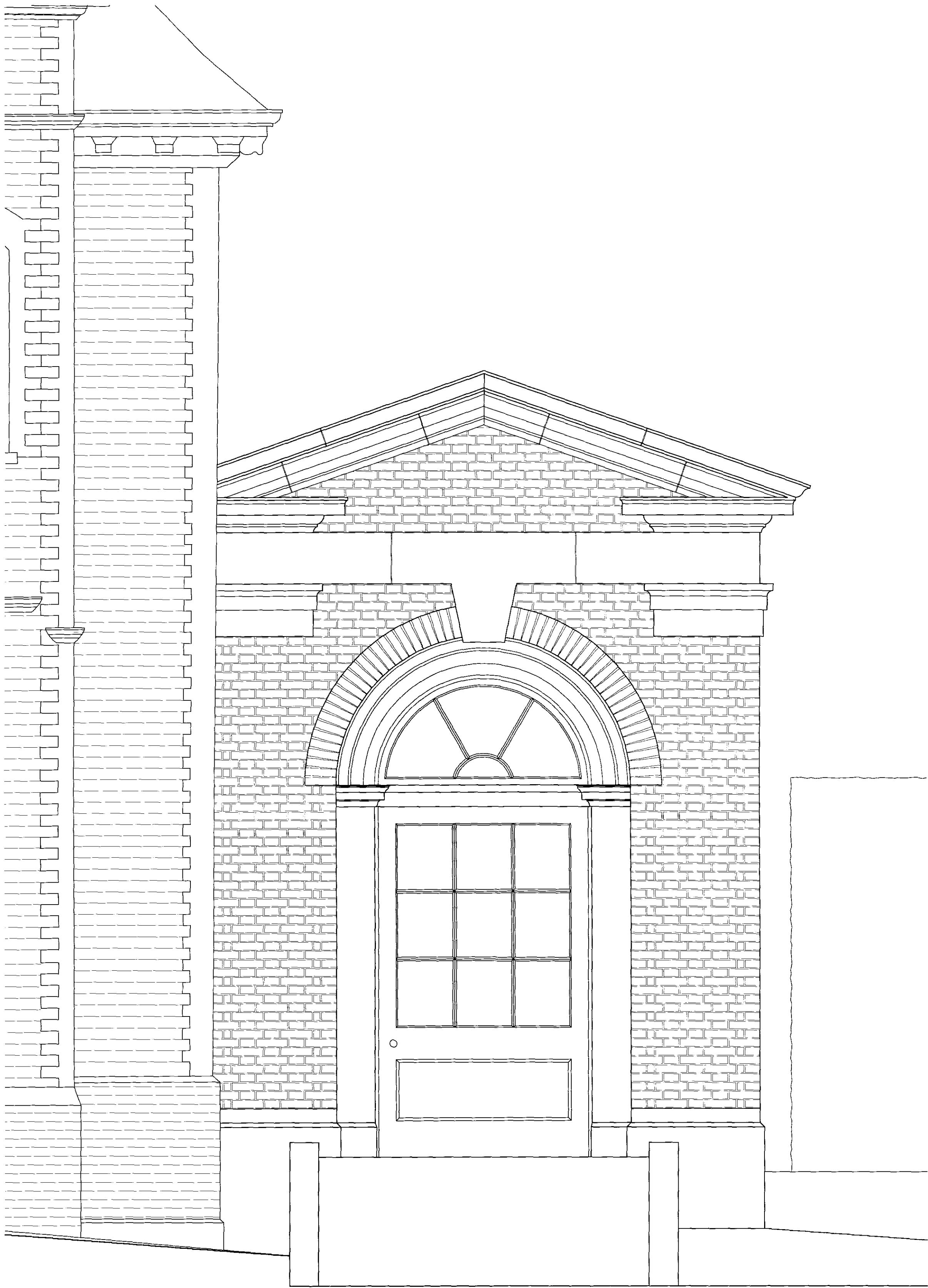
Proposed Detail of West Elevation of South-West Lodge (Elevation K)

Adjacent Properties and Boundaries are shown for illustrative purposes only and have not been surveyed unless otherwise stated. All areas shown are approximate and should be verified before forming the basis of a decision. Do not scale other than for Planning Application purposes. All dimensions must be checked by the contractor before commencing work on site. No deviation from this drawing will be permitted without the prior written consent of the Architect. The copyright of this drawing remains with the Architect and may not be reproduced in any form without prior written consent. Ground Floor Slabs, Foundations, Sub-Structures, etc. All work below ground level is shown provisionally. Inspection of ground condition is essential prior to work commencing. Reassessment is essential when the ground conditions are apparent, and redesign may be necessary in the light of soil conditions found. The responsibility for establishing the soil and sub-soil conditions rests with the contractor.