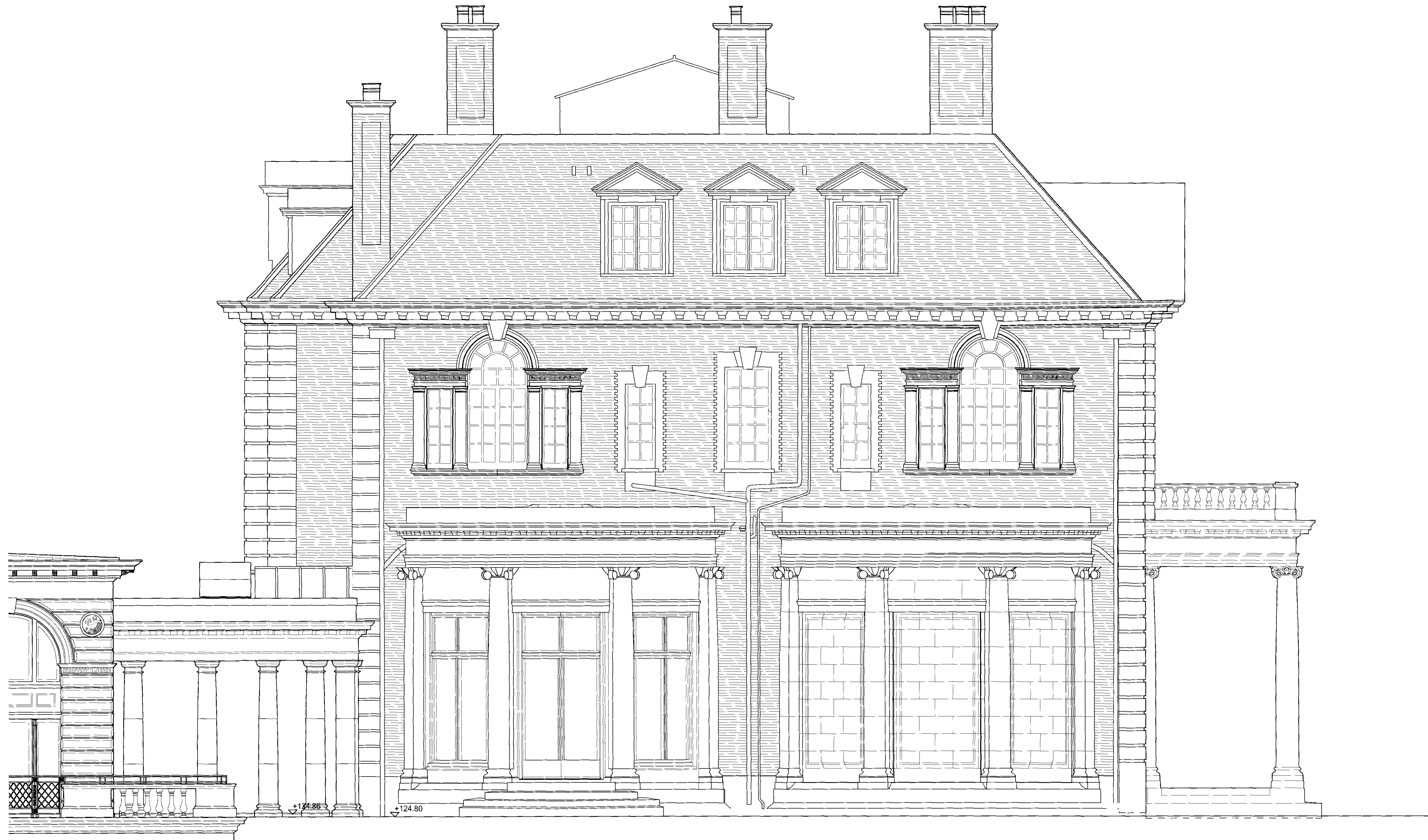
North Elevation of House Showing junction with curved Link (Elevation 14)

Adjacent Properties and Boundaries are shown for illustrative purposes only and have not been surveyed unless otherwise stated. All areas shown are approximate and should be verified before forming the basis of a decision. Do not scale other than for Planning Application purposes. All dimensions must be checked by the contractor before commencing work on site. No deviation from this drawing will be permitted without the prior written consent of the Architect. The copyright of this drawing remains with the Architect and may not be reproduced in any form without prior written consent. Ground Floor Slabs, Foundations, Sub-Structures, etc. All work below ground level is shown provisionally. Inspection of ground condition is essential prior to work commencing. Reassessment is essential when the ground conditions are apparent, and redesign may be necessary in the light of soil conditions found. The responsibility for establishing the soil and sub-soil conditions rests with the contractor.