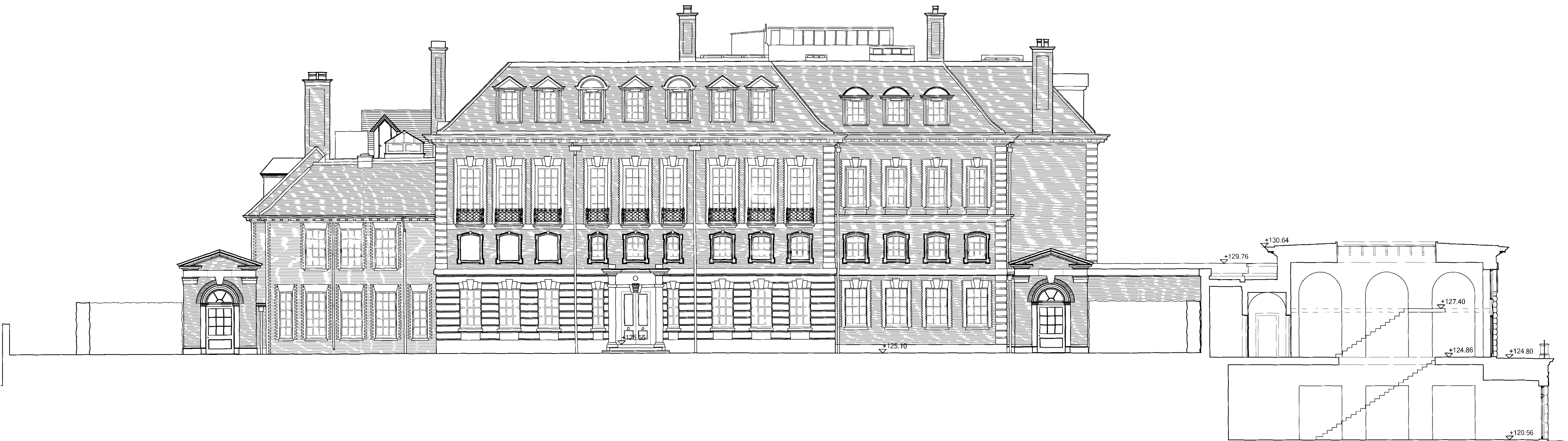
Proposed East Elevation of House & Lodges (Elevation 9)

Adjacent Properties and Boundaries are shown for illustrative purposes only and have not been surveyed unless otherwise stated.