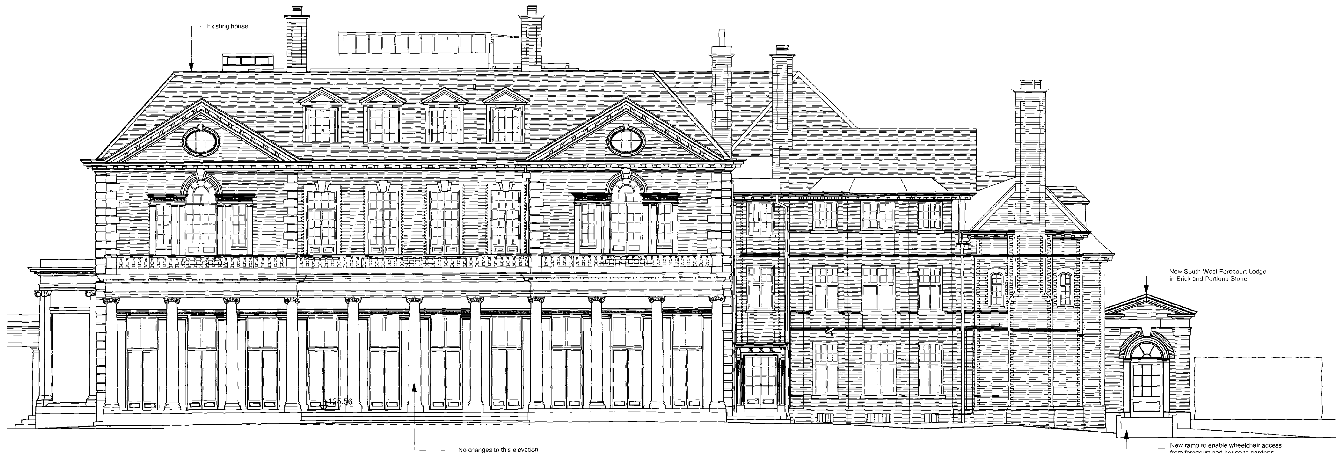
Proposed West Elevation of House and Lodge (Elevation 1)

Adjacent Properties and Boundaries are shown for illustrative purposes only and have not been surveyed unless otherwise stated. All areas shown are approximate and should be verified before forming the basis of a decision. Do not scale other than for Planning Application purposes. All dimensions must be checked by the contractor before commencing work on site. No deviation from this drawing will be permitted without the prior written consent of the Architect. The copyright of this drawing remains with the Architect and may not be reproduced in any form without prior written consent. Ground Floor Slabs, Foundations, Sub-Structures, etc. All work below ground level is shown provisionally. Inspection of ground condition is essential prior to work commencing. Reassessment is essential when the ground conditions are apparent, and redesign may be necessary in the light of soil conditions found. The responsibility for establishing the soil and sub-soil conditions rests with the contractor.