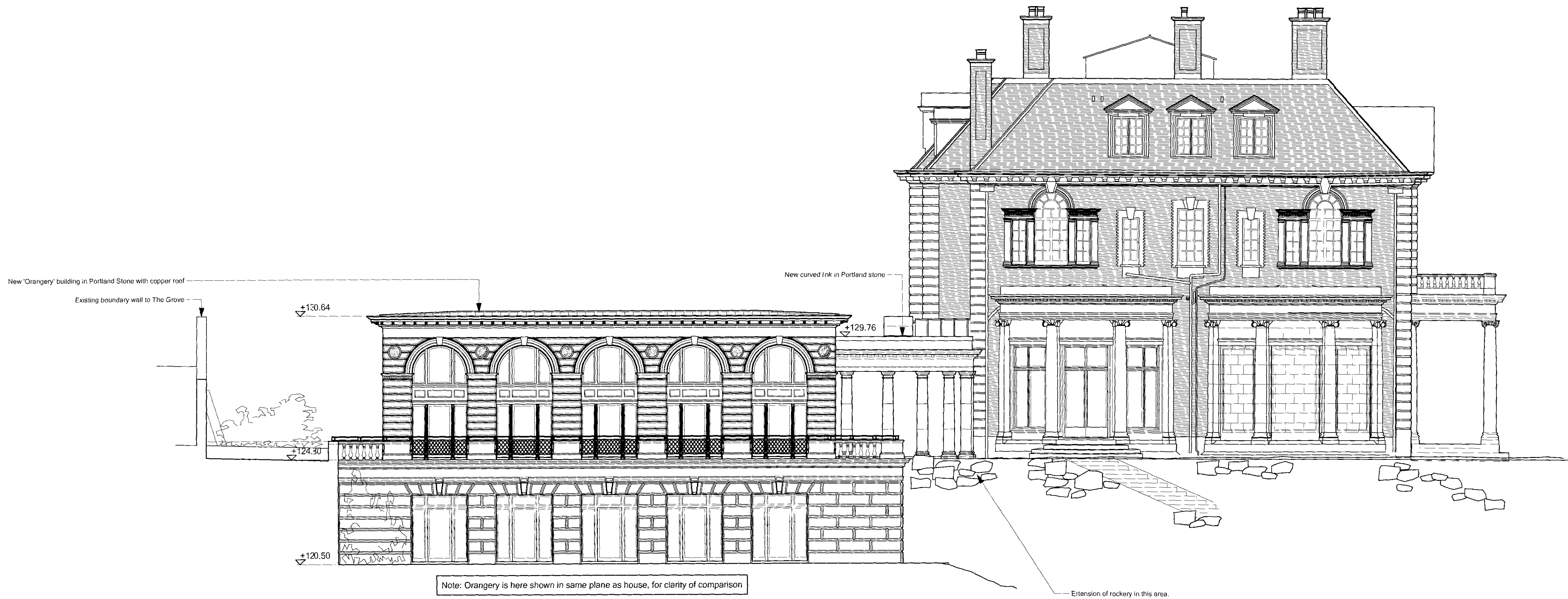
Proposed North Elevation of Orangery (Elevation 2)

Adjacent Properties and Boundaries are shown for illustrative purposes only and have not been surveyed unless otherwise stated.