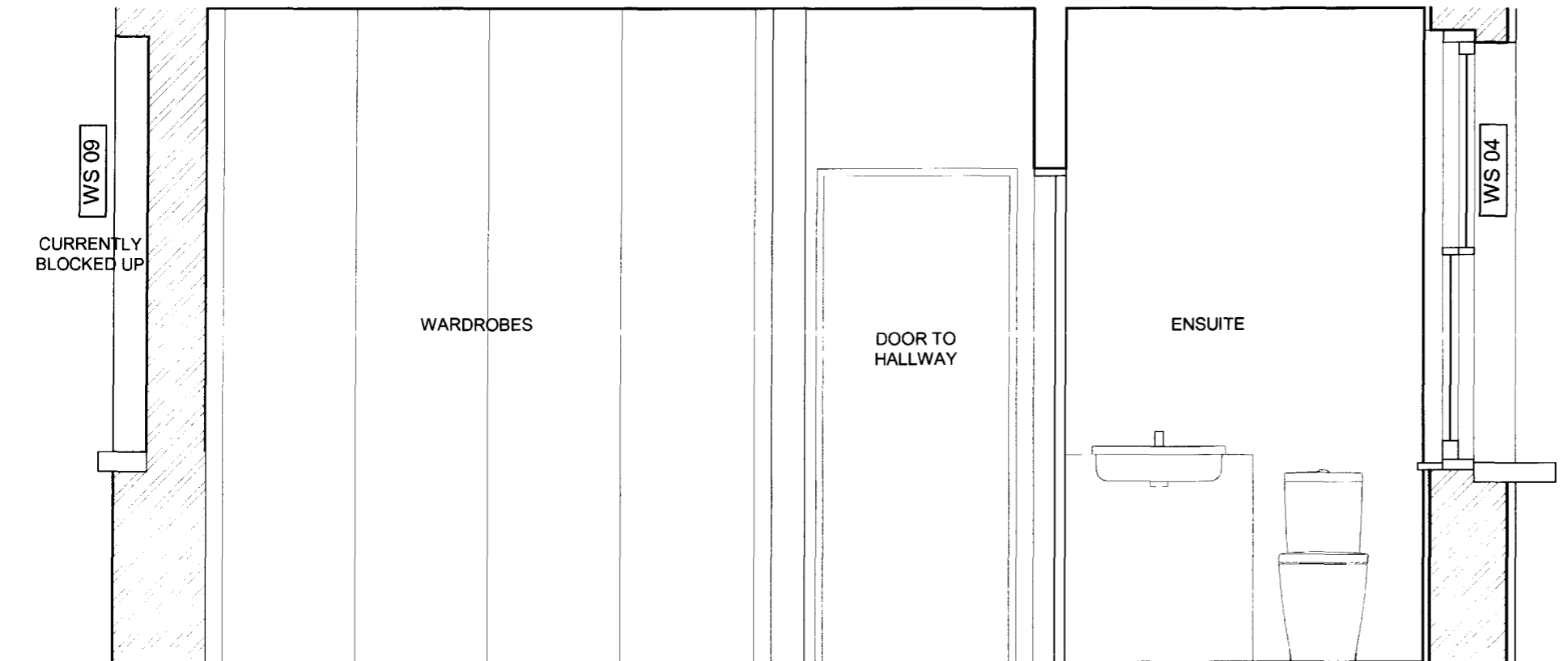
ELEVATION B AS EXISTING