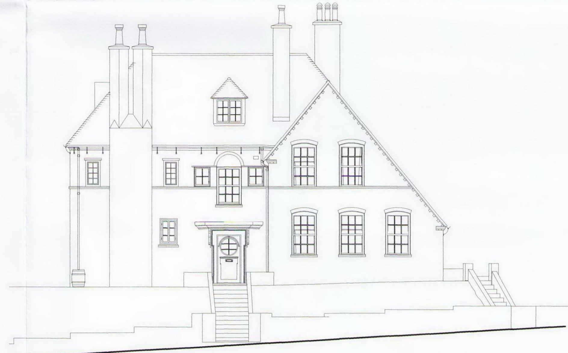
FRONT ELEVATION (EAST)