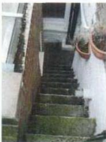
Photo of existing rear facade of property & of steps leading from garden level to ground floor kitchen