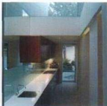
Work Sample 4: Extension and side infill to 23 Elliot Road, London, W4