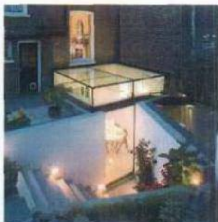
Work Sample 3: Basement extension to 12 Wallace Road, Islington, London N1 (Conservation Area, AJ Small Projects Award 2007)