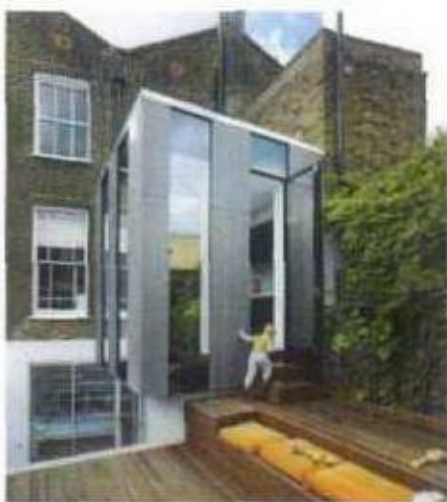
Work Sample 2: Slate and glass extension to 54 Coity Road, Camden, London, NW5 (Conservation area)