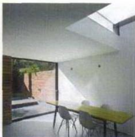
Work Sample 1: Contemporary extension to 6 Mary Sreet, Islington, London, N1 (Conservation Area)