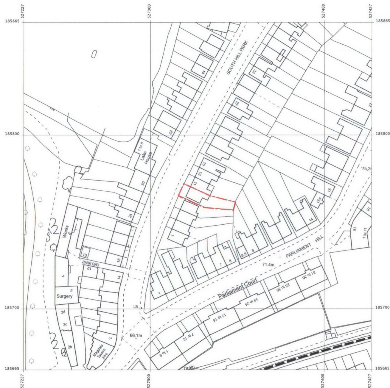
Ordnance Survey Plan Scale 1:1250