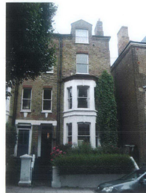
Front elevation no.9 South Hill Park