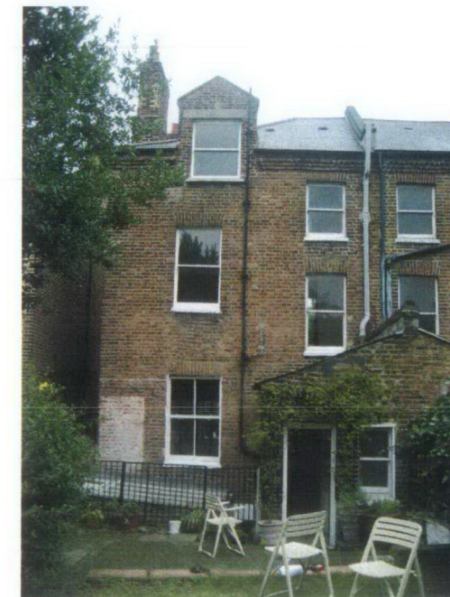
Rear elevation no.9 South Hill Park