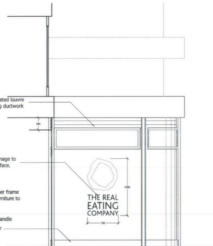
SECTION BB 1:50 @ A3

New timber frame shopfront, glazed timber doors on a bi fold system hung with transom detail above.