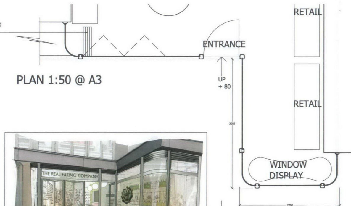
PLAN 1:50 @ A3

New timber frame shopfront, glazed timber doors on a bi fold system hung with transom detail above.