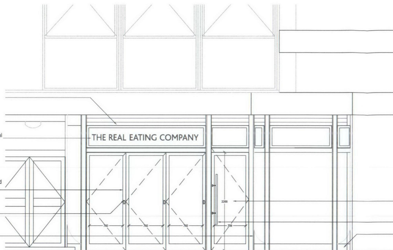
ELEVATION AA 1:50 @ A3