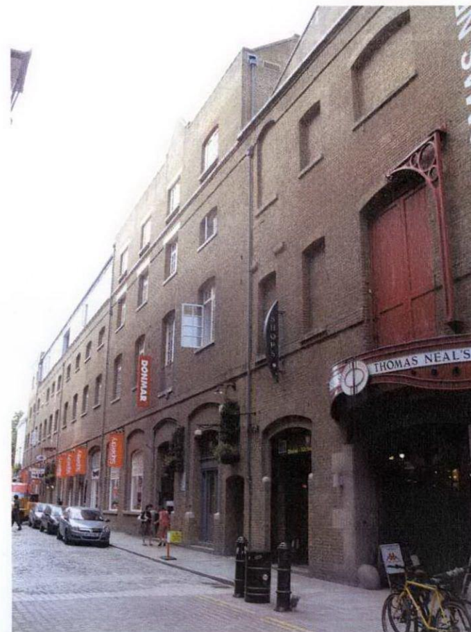
VIEW FROM EARLAM STREET