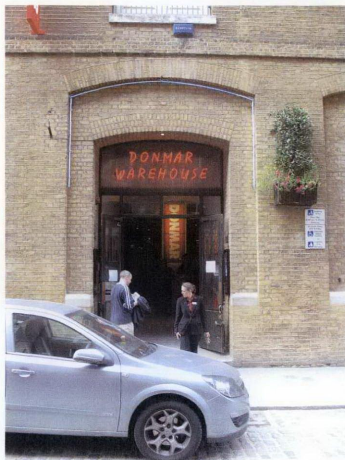
MAIN ENTRANCE IN EARLAM STREET