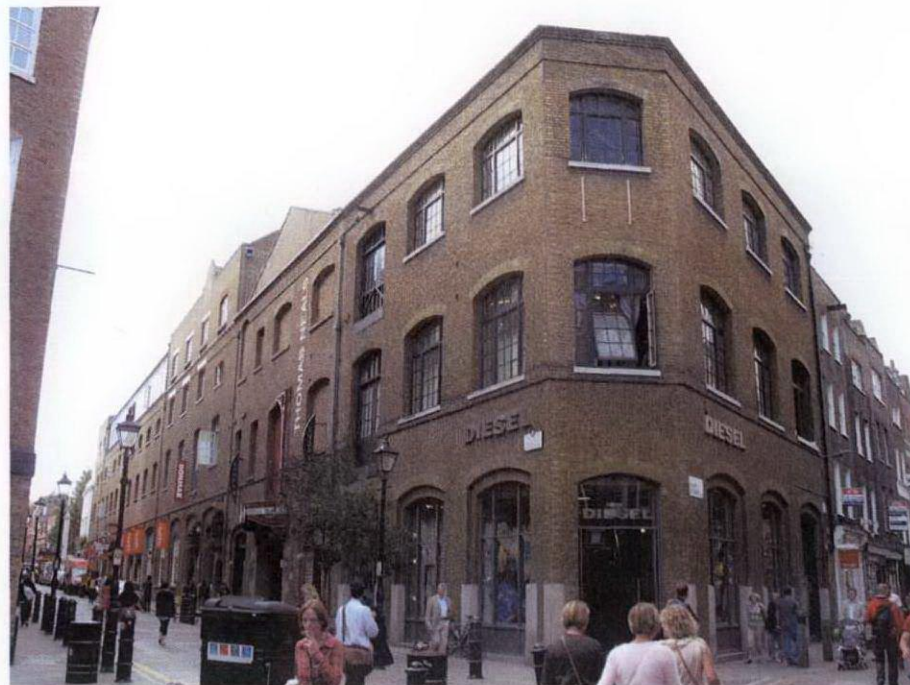
VIEW FROM NEAL STREET