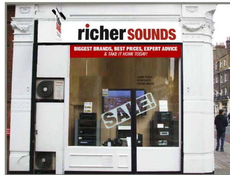
P2 - BURY PLACE