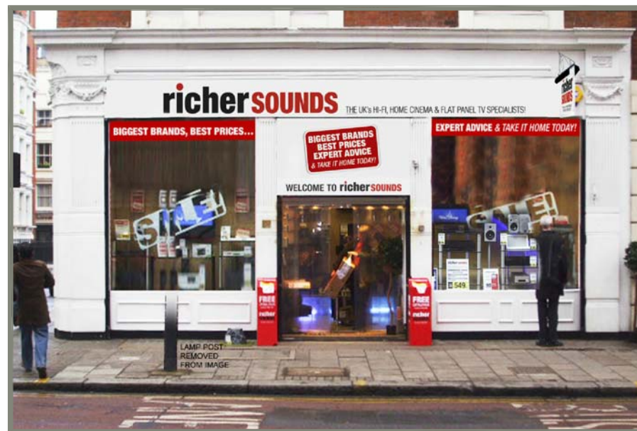
P1 - BLOOMSBURY WAY