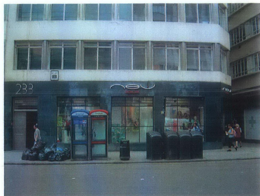
Photograph of existing signage not to scale.

Please note we do not have a section through the fascia as lettering, both existing and proposed are to be fixed to existing tiled fascia.