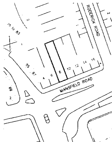
ORDNANCE SURVEY Scale 1:1250