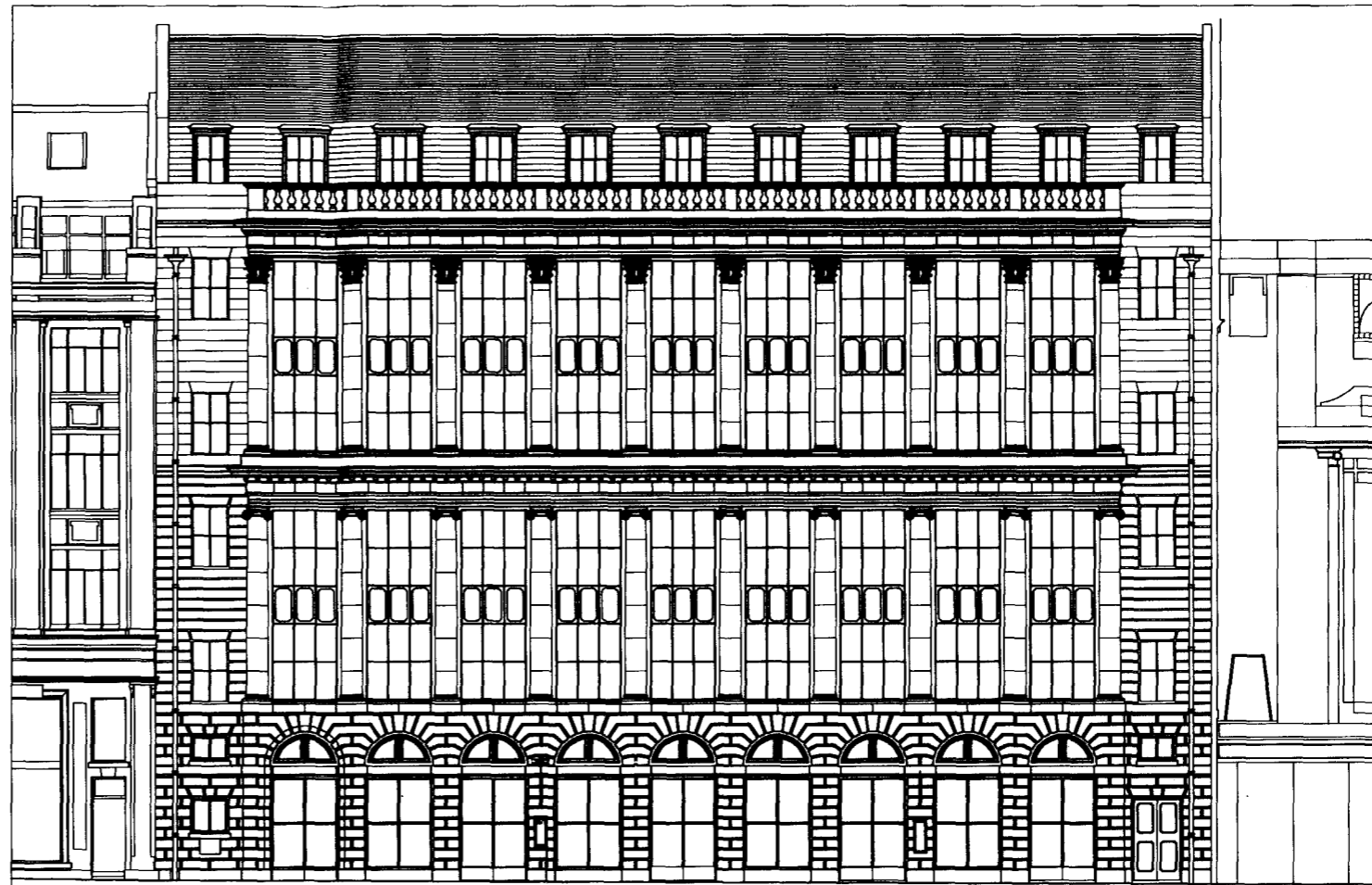
PROPOSED ELEVATION INDICATING NEW SIGNAGE SHOP FRONT TO 284-287 TOTTENHAM COURT ROAD SCALE: 1:100 @ A1