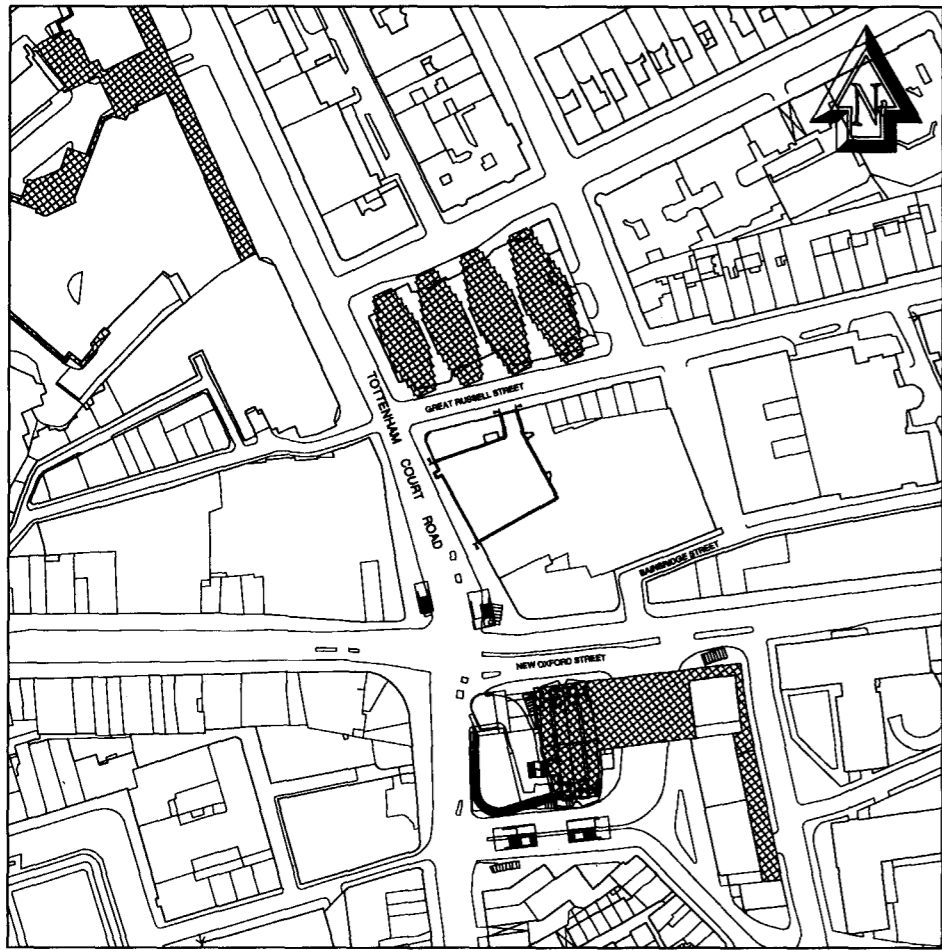
LOCATION PLAN SCALE: 1:250 @ A1