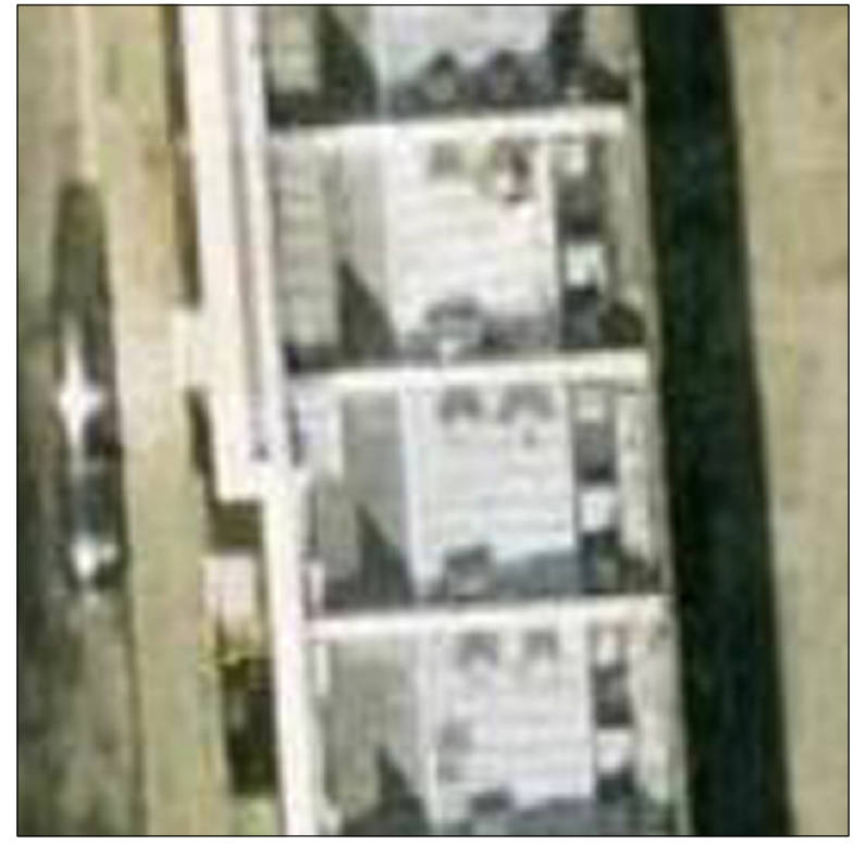
3 | AERIAL PHOTOGRAPH SHOWING SITE 'GOOGLE EARTH' 0000 1:200 (A3)

NOTES : All dimensions in millimetres. All dimensions and levels are to be checked on site by the main contractor prior to commencing excavation works. any discrepancy is to be reported back to the designer for instruction. This drawing is the property of ARGENT DESIGN LIMITED and may not be reproduced or disclosed to a third party in any form without written permission ARGENT DESIGN drawings are for information only, and not to be used for construction purposes.