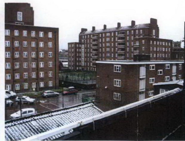
VIEW FROM REAR OF 3 CASTLE ROAD, PUBLIC HOUSE YARD, INDUSTRIAL UNIT & 6 STOREY HOUSING BEYOND