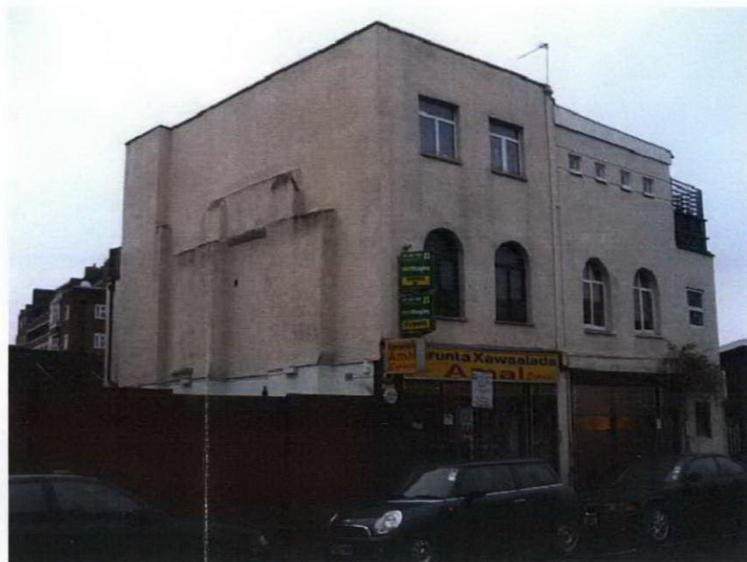
FRONT VIEW OF 3 CASTLE ROAD