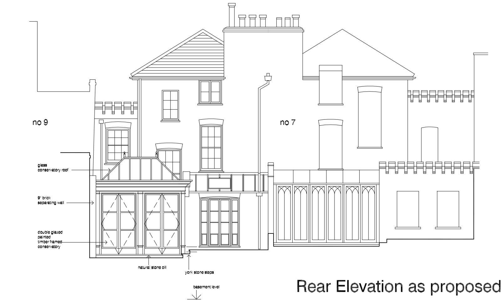
Rear Elevation as proposed