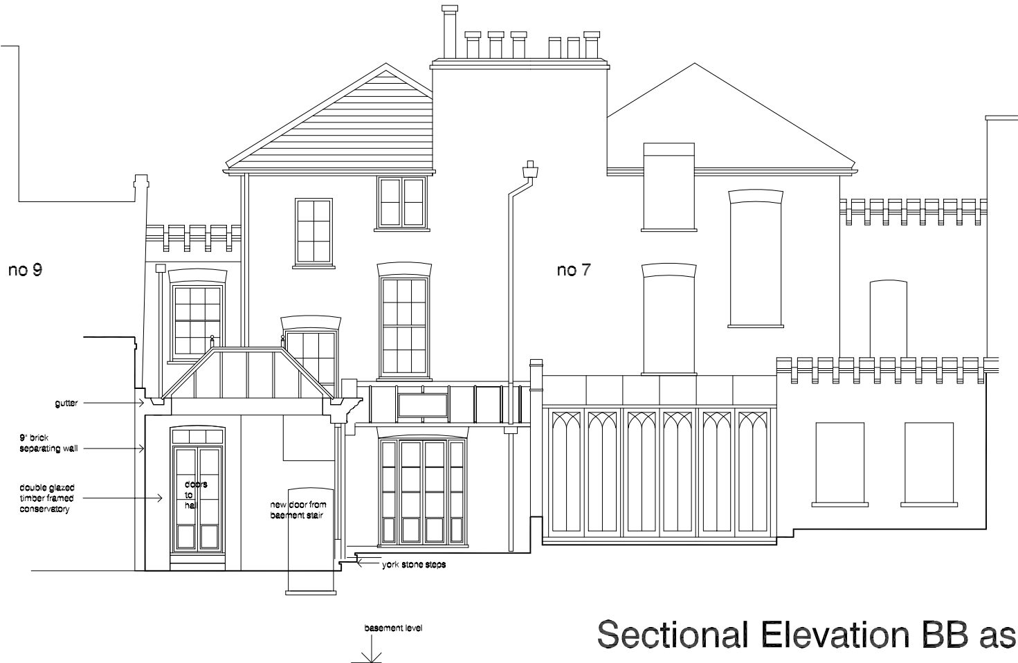
Sectional Elevation BB as proposed