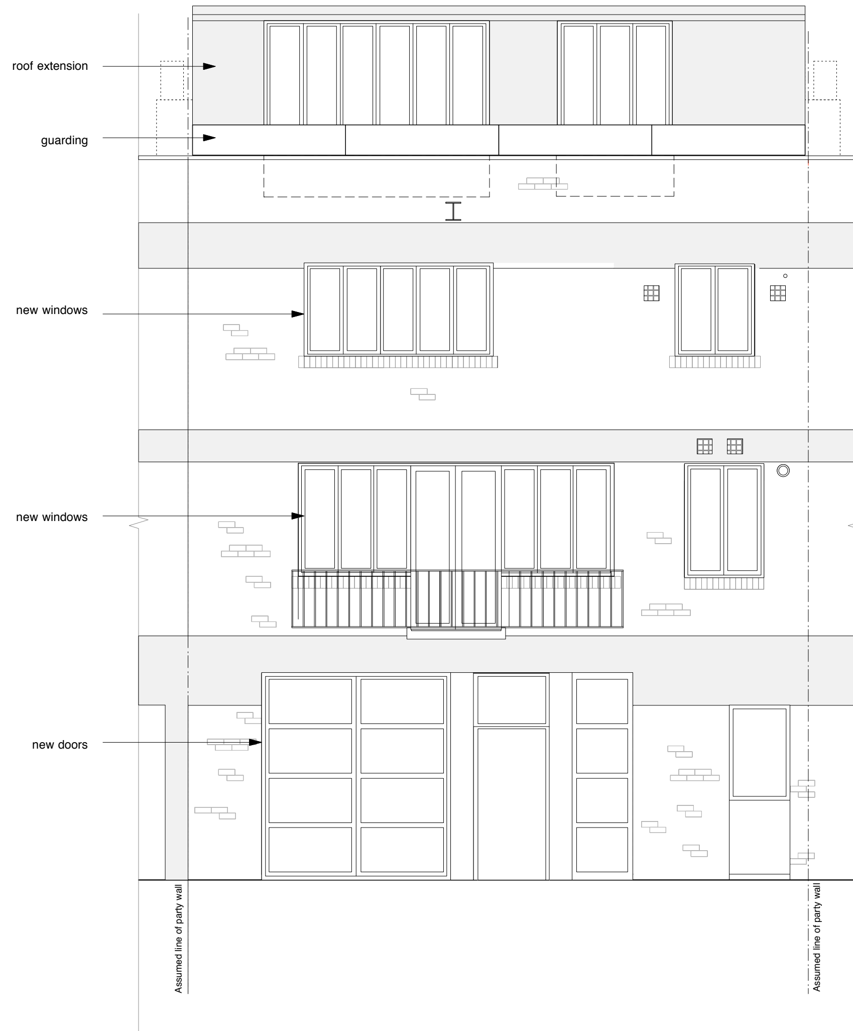
Planning Approved Proposed Front Elevation 1:50