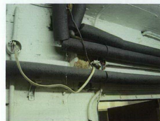
Photo showing service pipes in existing store room