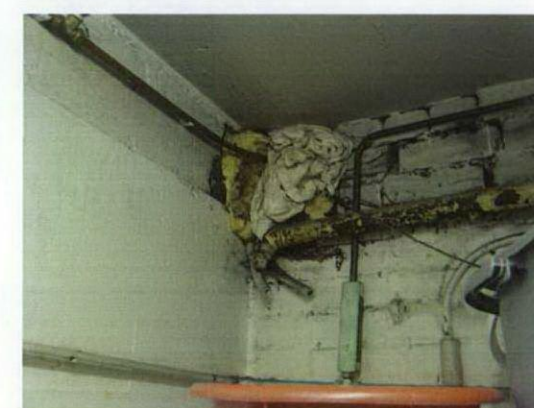
Photo showing service pipes in existing store room