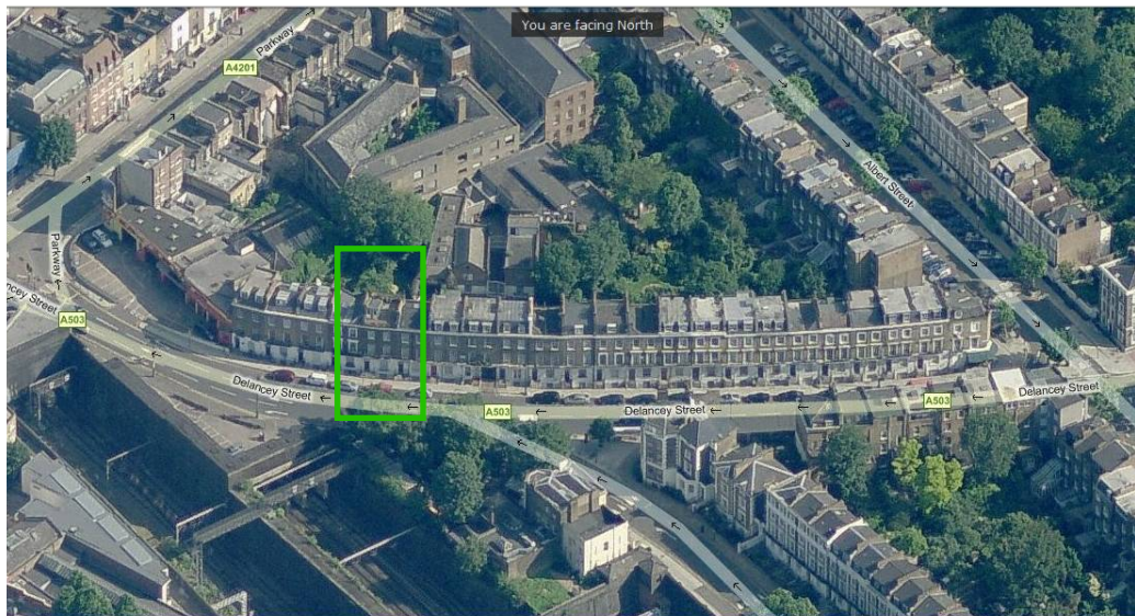
Aerial Image of 76 Delancey Street – Facing North

76 Delancey Street is a mid-terrace property on the north side of the street. The current & existing use of the property is residential – C3. The building comprises of two maisonettes. 76A occupies the Lower Ground and Ground Floor with a garden amenity.