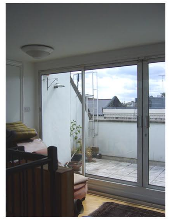
Top floor view to front terrace