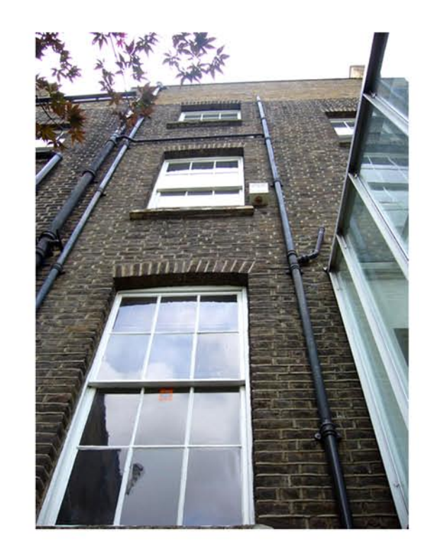
View from lower ground floor patio