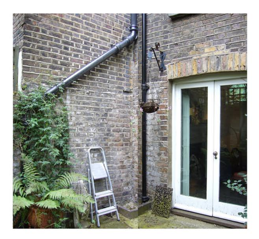
Lower ground floor patio