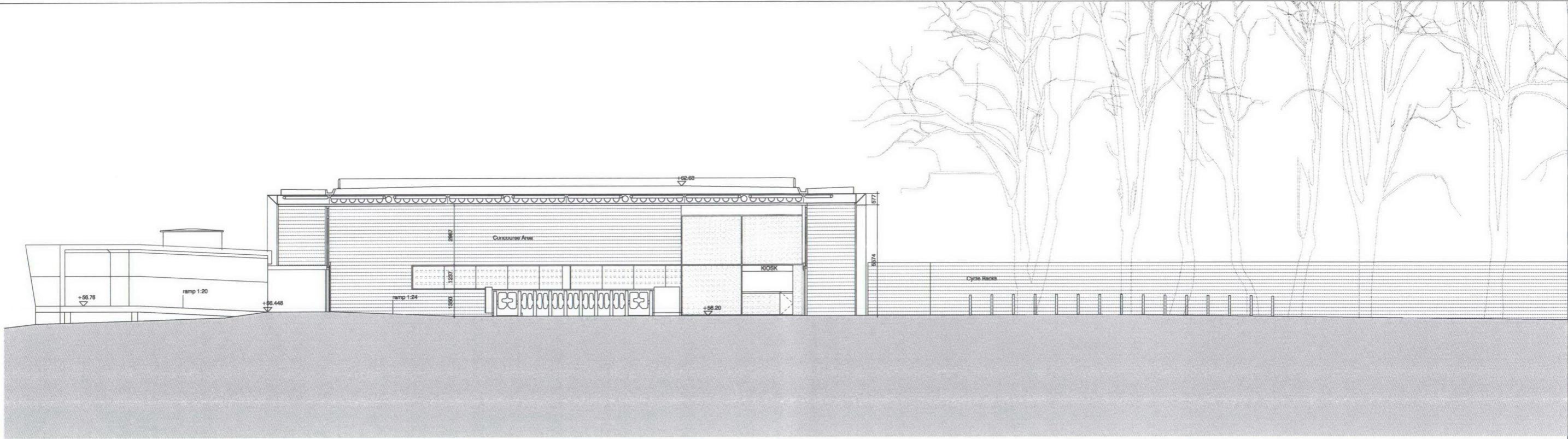
Section A A