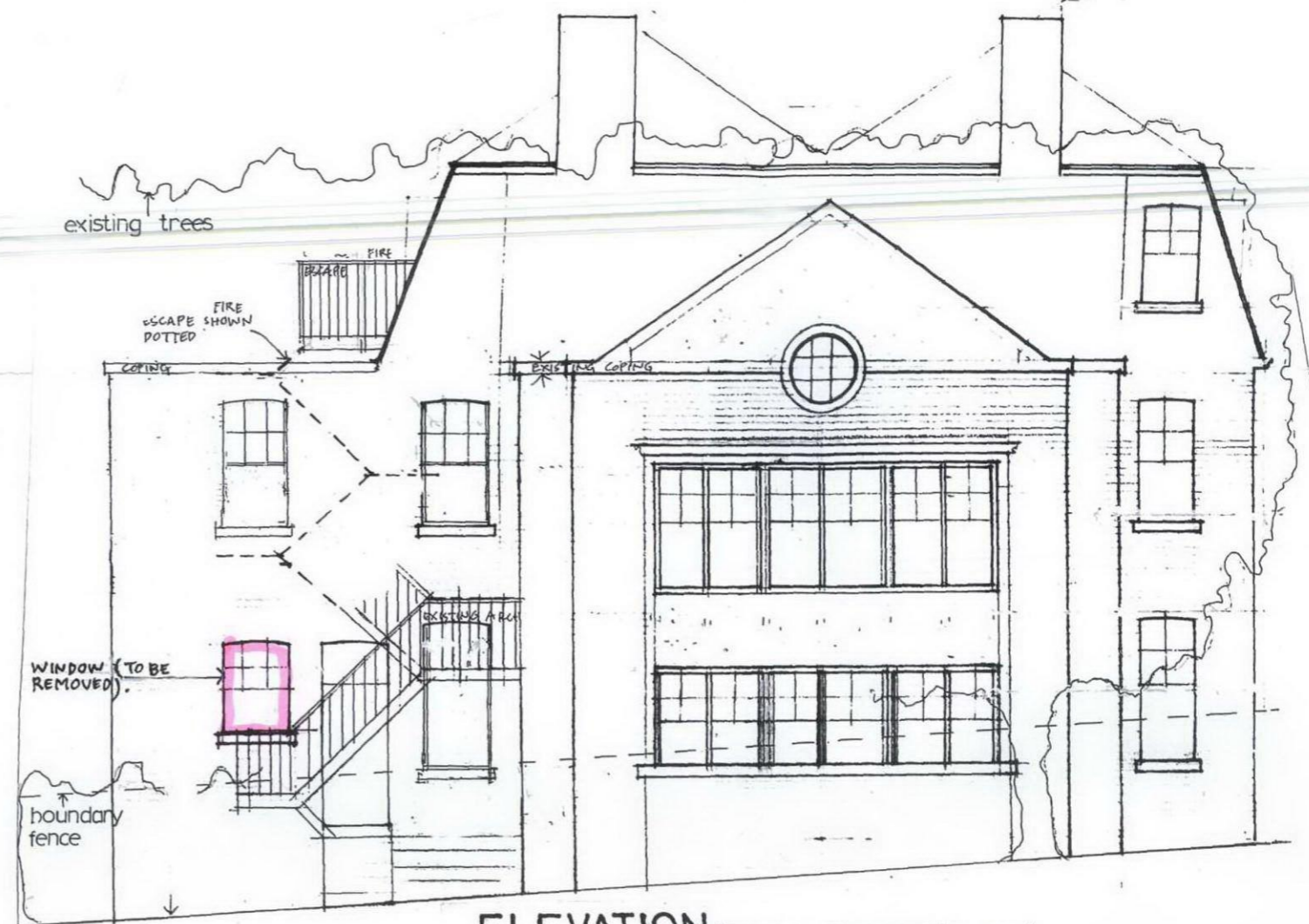
ELEVATION (FROM FERNCROFT AVE)