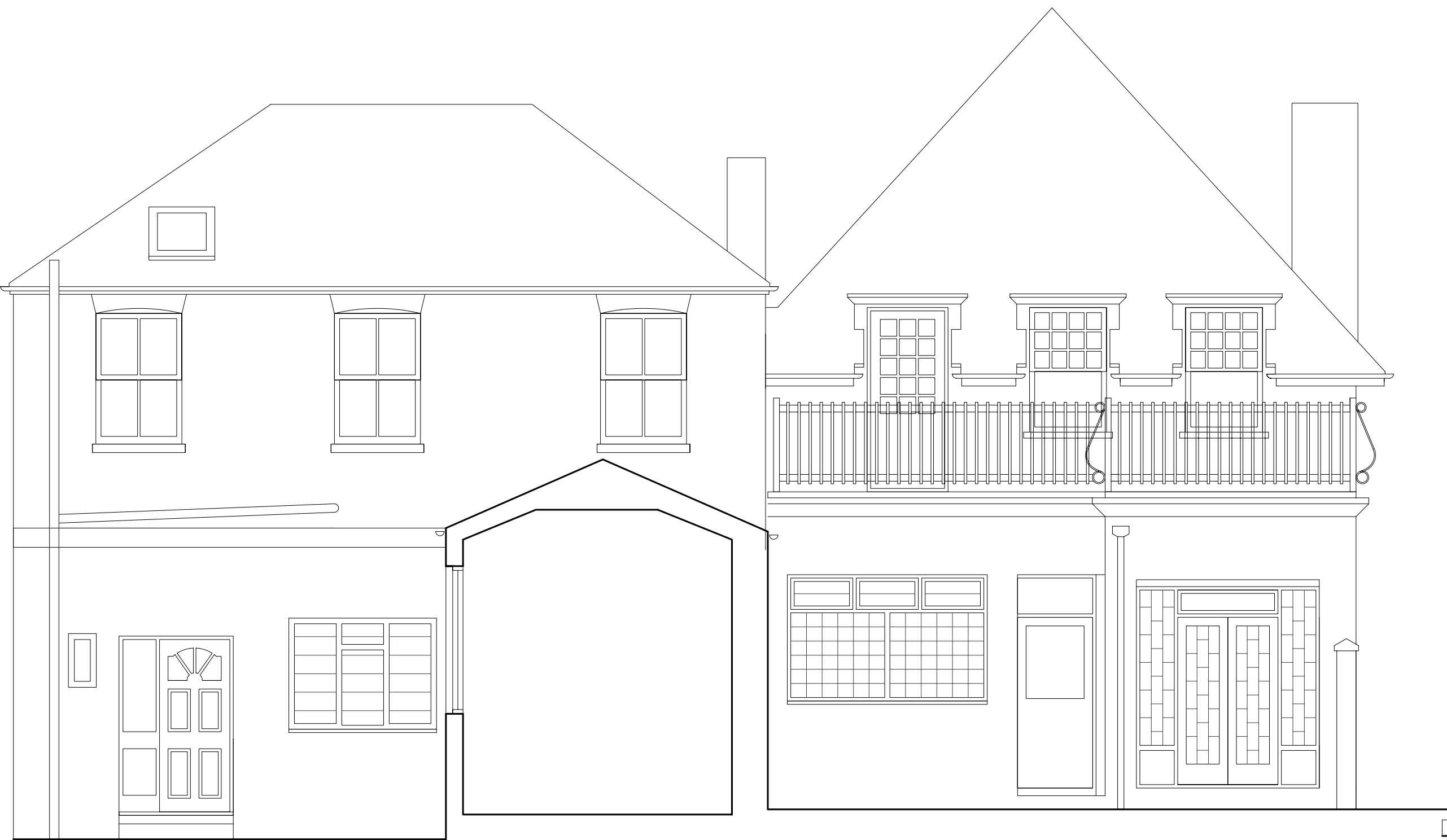
Courtyard (East) Elevation / Section C:C