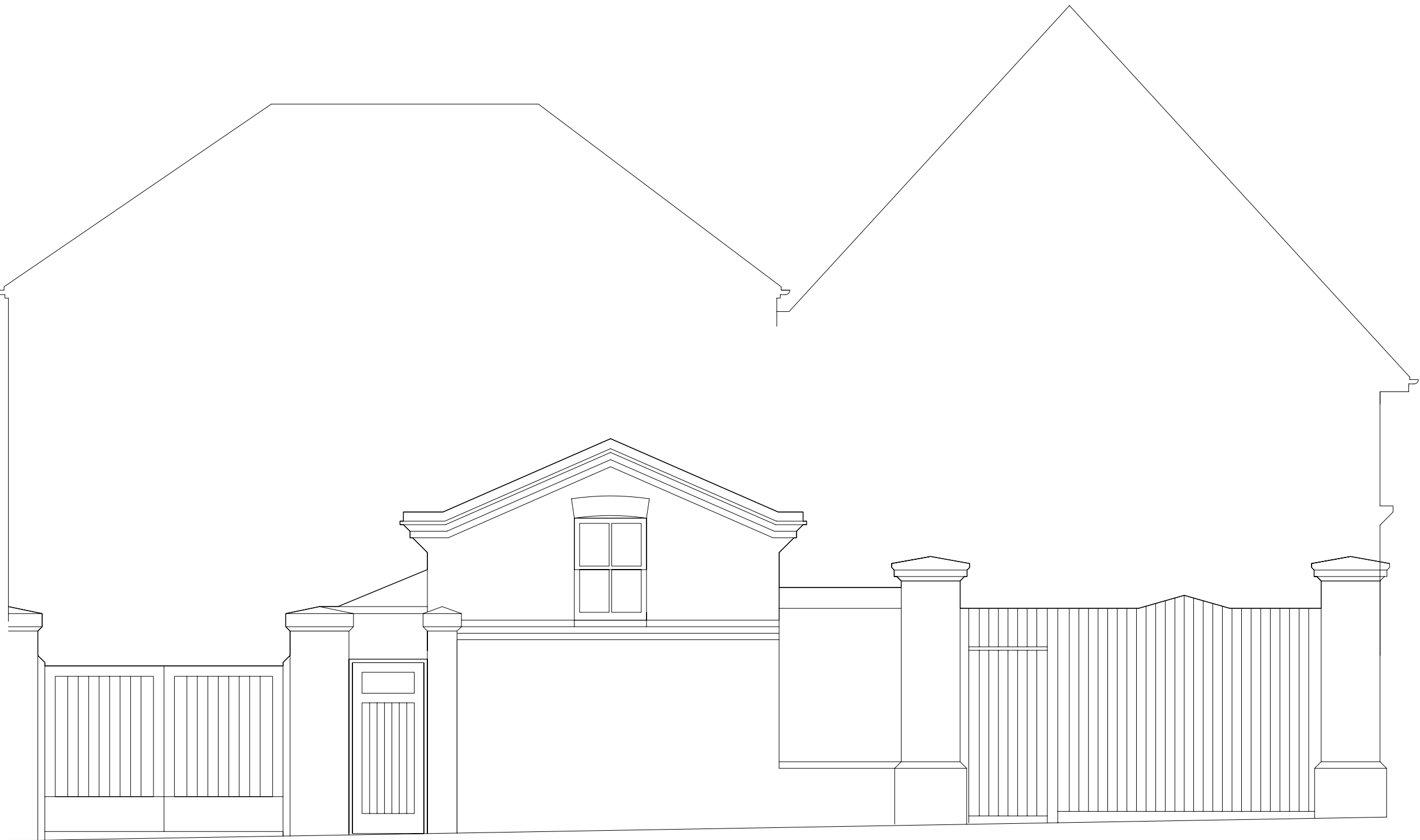
Street (East) Elevation