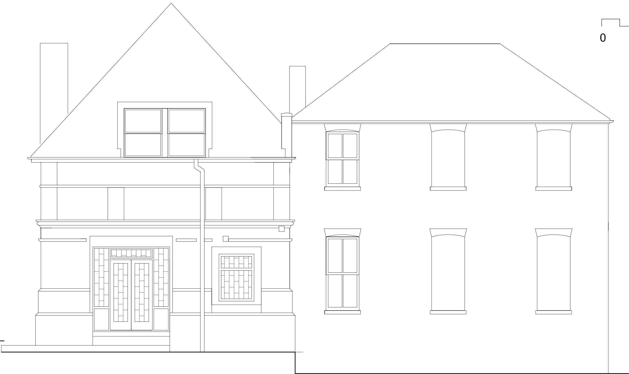
Rear (West) Elevation