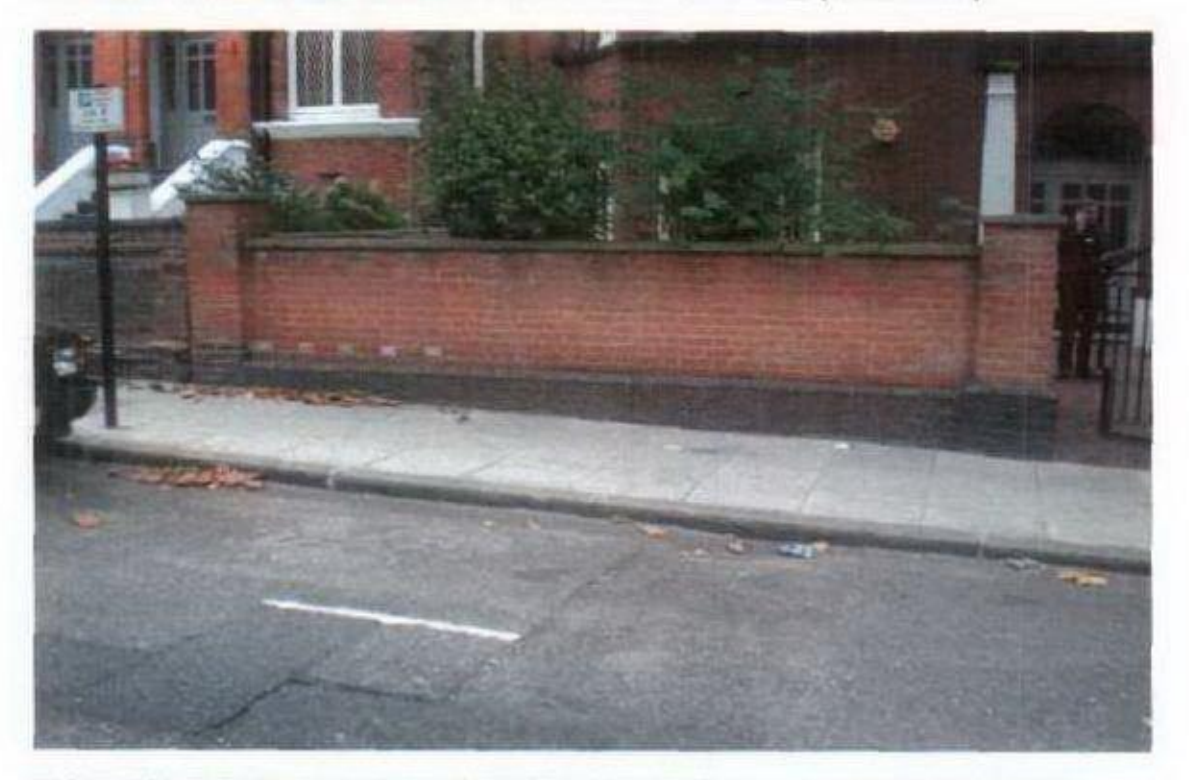
ELEVATION OF EXISTING LEFT-HAND SECTION OF FRONT BOUNDARY WALL (TO REMAIN)