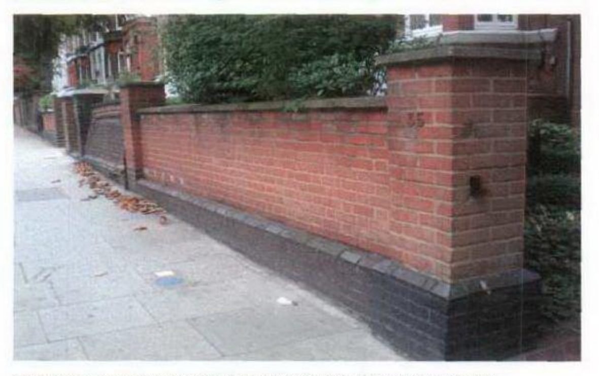
EXISTING LEFT-HAND SECTION OF FRONT BOUNDARY WALL (TO REMAIN)

Photographs of the Existing Front Boundary Wall