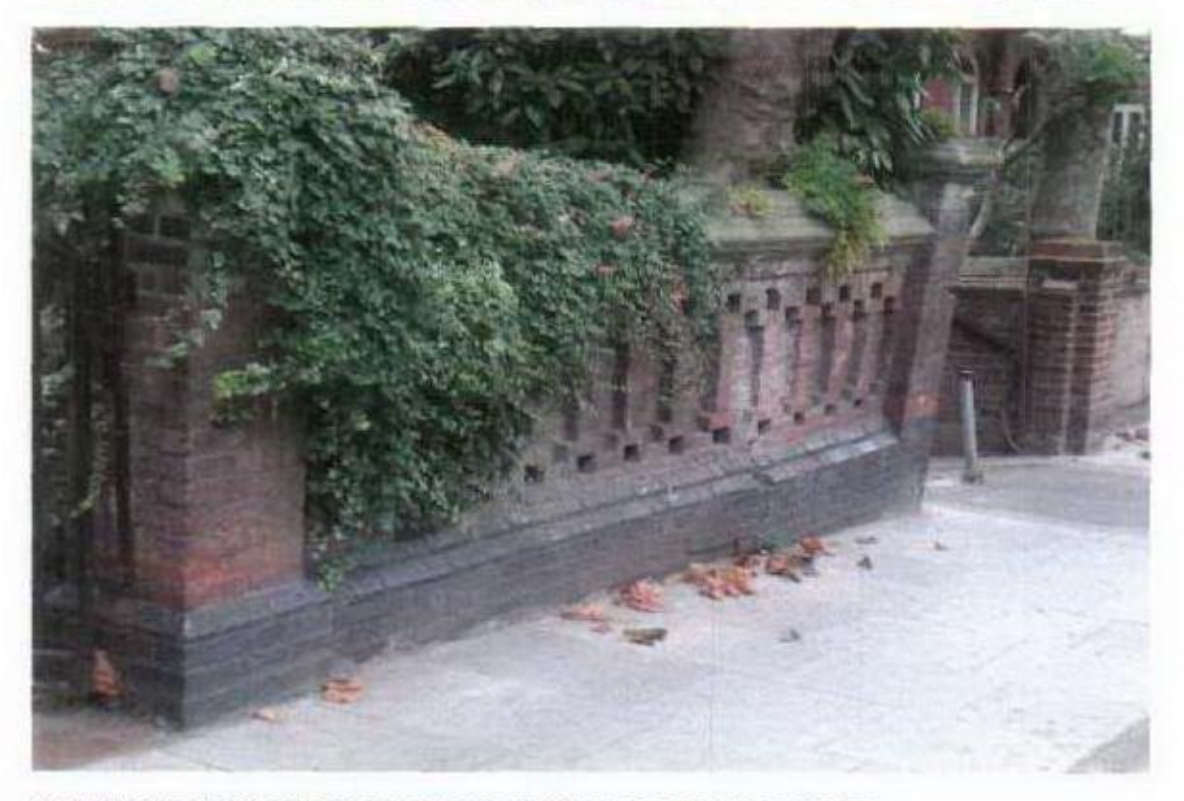
'LEAN' AND CRACKING TO SECTION OF WALL TO BE DEMOLISHED