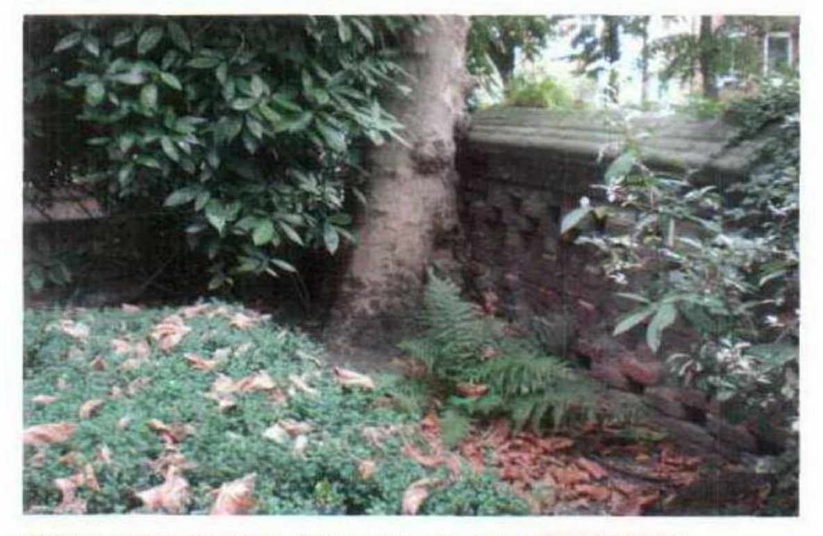
REAR VIEW OF RIGHT-HAND SECTION OF FRONT BOUNDARY WALL TO BE DEMOLISHED SHOWING MATURE TREE