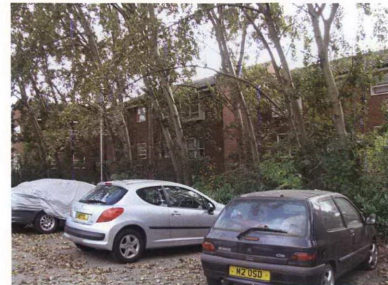
CAR PARK SITUATED AT REAR OF BLOCK