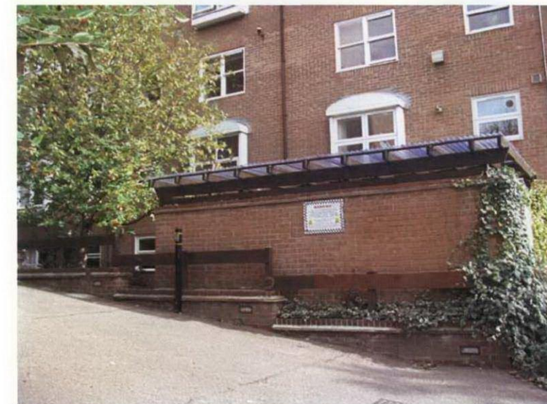
STYLE OF BIKE STORE TO MATCH EXISTING BIN SOTRE

Unspecified dimensions are not to be scaled off this drawing. If dimensions or details on these drawings conflict with other drawing information precedence shall be given to the larger scale drawings. Where the drawing relates to existing buildings or completed construction the contractor is responsible for checking that there is no conflict between actual building dimensions and drawing dimensions. In the event of discrepancies between this drawing and subcontractor's working drawings for relevant building components, the subcontractor's drawing shall take precedence. Any conflicts arising out of information as noted above must be reported immediately to Ringley Chartered Surveyors. This drawing is the copyright of Ringley Chartered Surveyors and it is forbidden to reproduce this drawing in part or full without written permission. All dimensions are in millimetres unless otherwise stated.