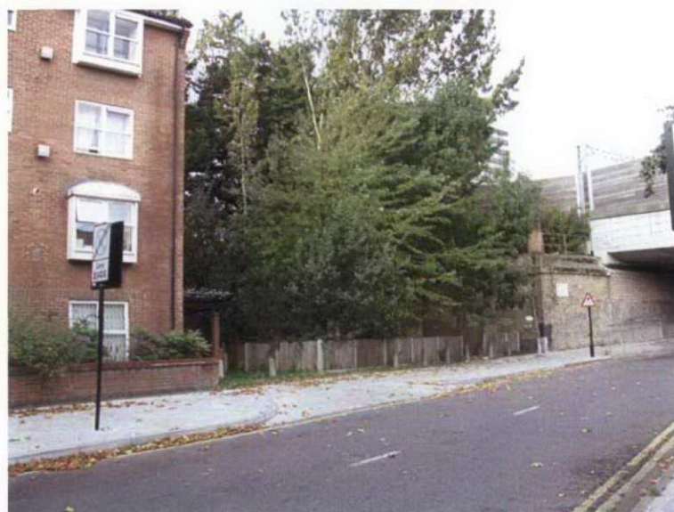
LAND TO CAMLEY STREET NEEDS SECURITY FENCING