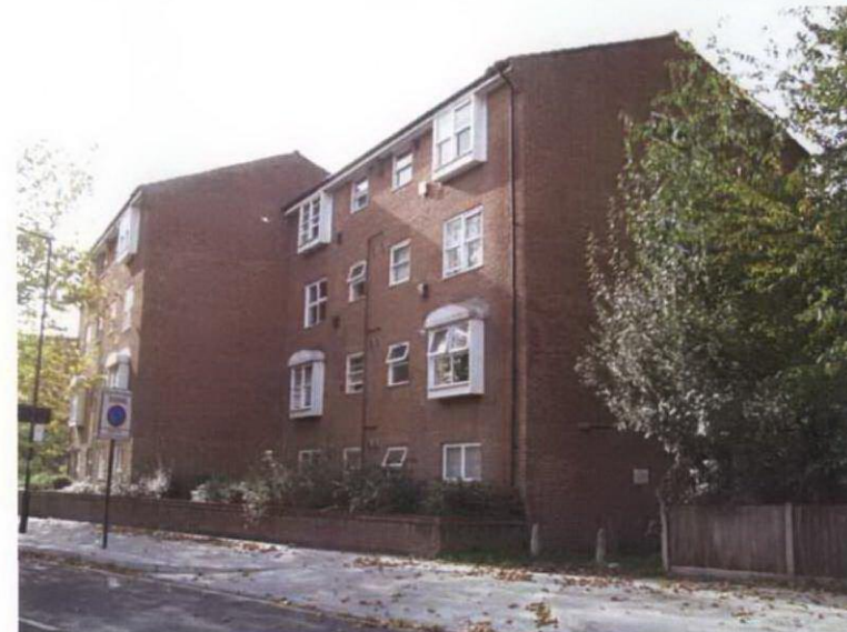
SIDE ELEVATION, CAMLEY STREET