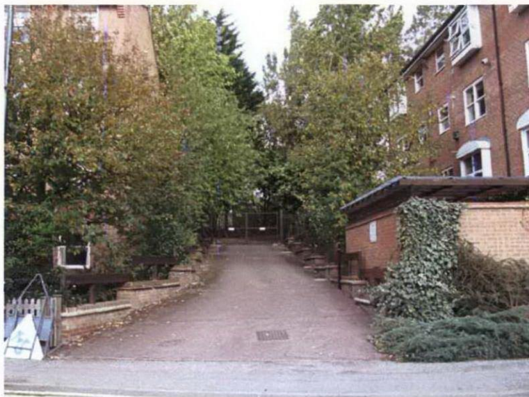
BARKER DRIVE SIDE ENTRY TO CAR PARK