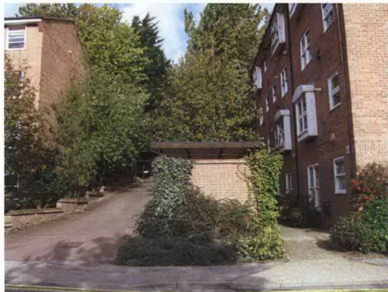
SIDE ELEVATION, TO CAR PARK