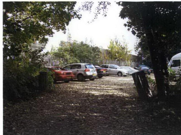
BARKER DRIVE CAR PARK