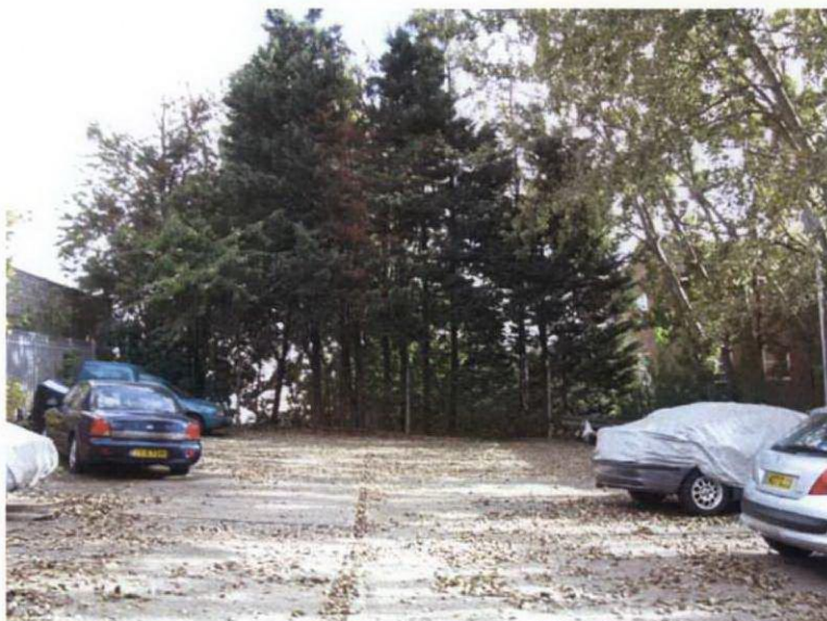
PROPOSED SITE FOR BIKE STORE AT END OF CAR PARK