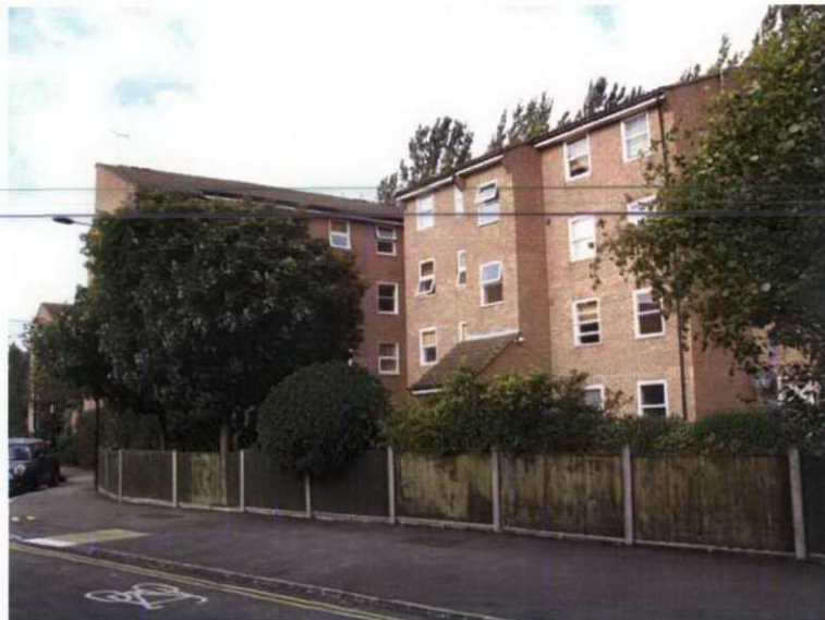
BARKER DRIVE FRONT ELEVATION