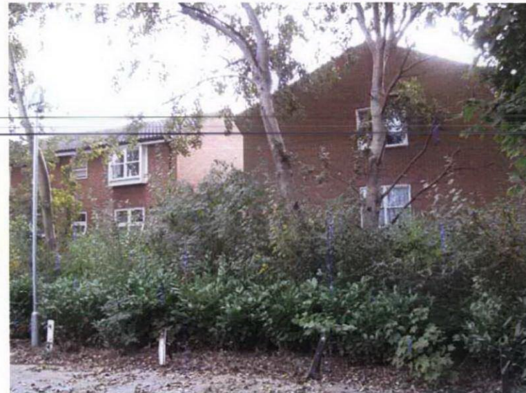
BARKER DRIVE REAR ELEVATION