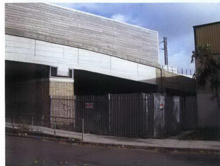
FENCE WILL MATCH THE ADJACENT SECURITY FENCE