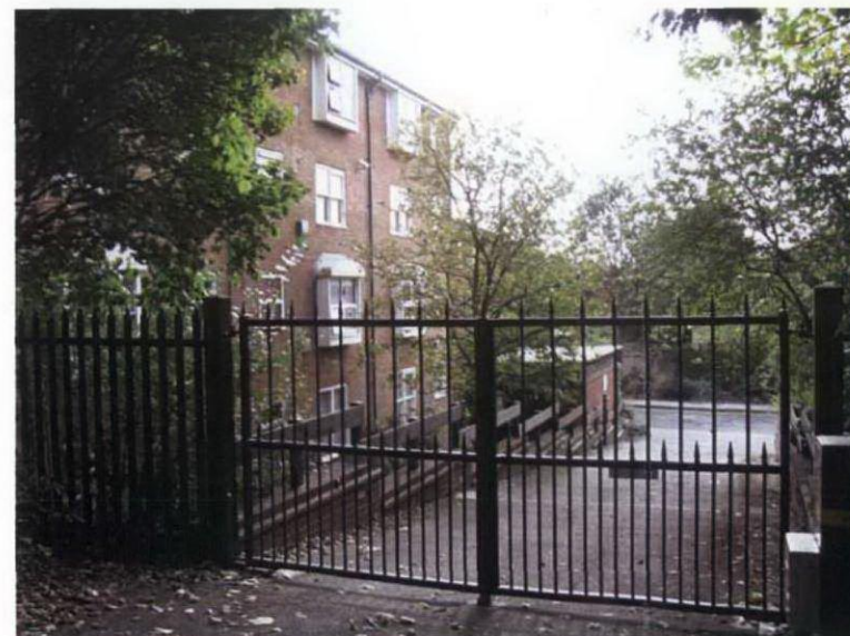
SECURITY GATE TO CAR PARK