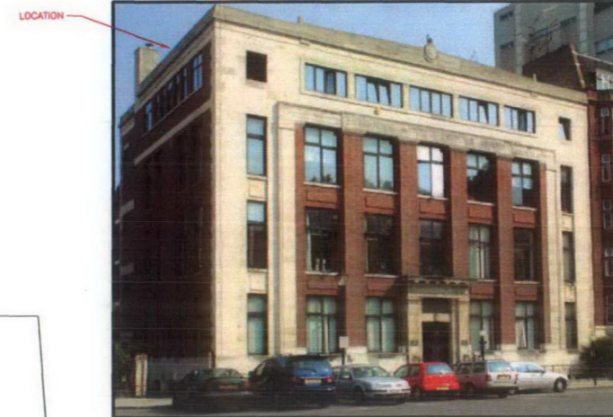
PHOTO A - EXTERNAL FACADES FROM SOUTH-WEST