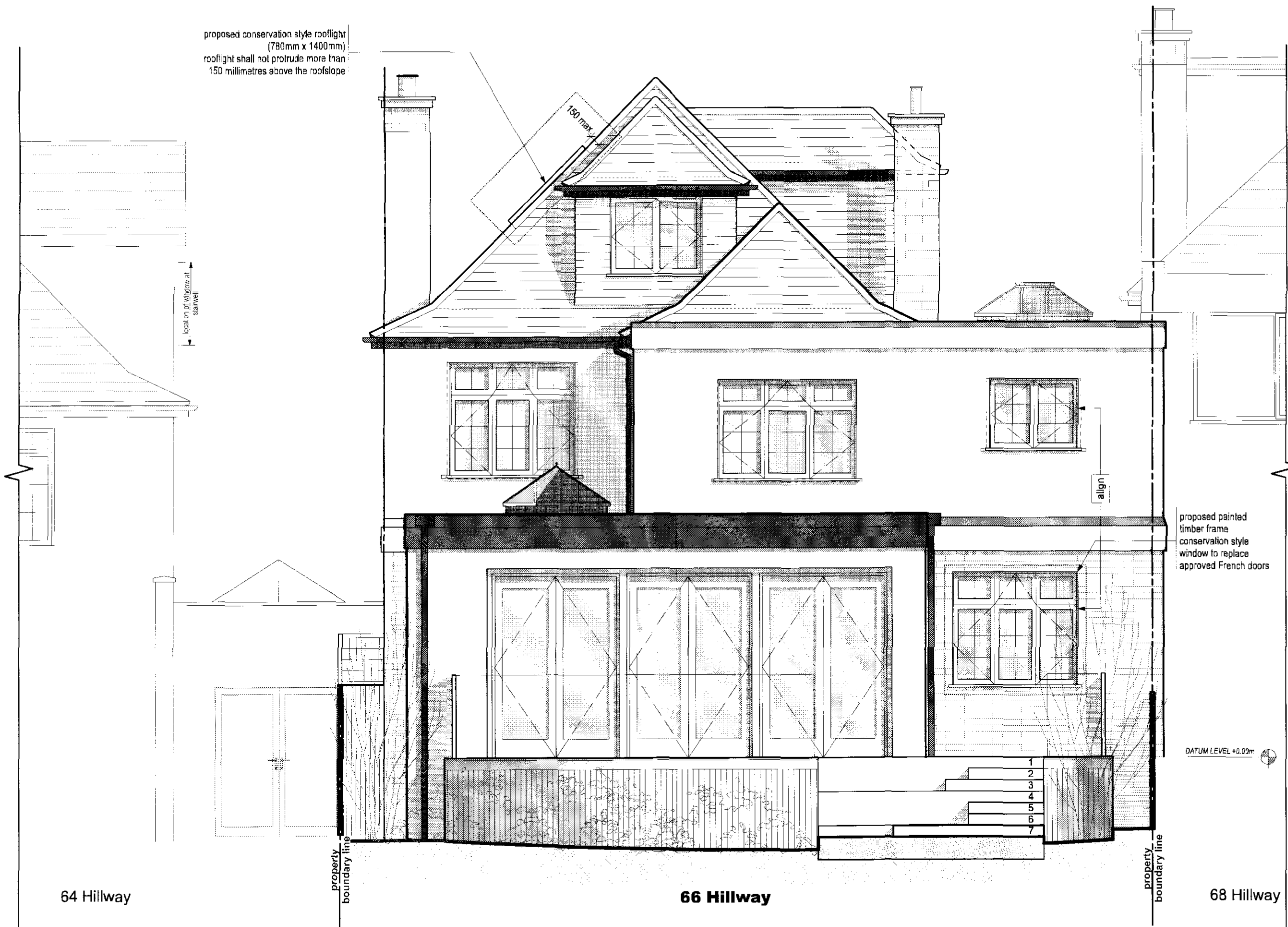
rear (east) elevation: proposed

NOTES: 1. Do not scale drawing. 2. Dimensions are in millimetres unless otherwise noted. 3. Drawings are subject to all necessary consents. 4. These drawings are for Planning Application purposes only and should not be used for construction. Dimensions, areas, levels and existing conditions & construction to be verified at all critical locations prior to further design development. 5. These drawings are the property of Peat Fire Studios and are not to be used without their prior approval.