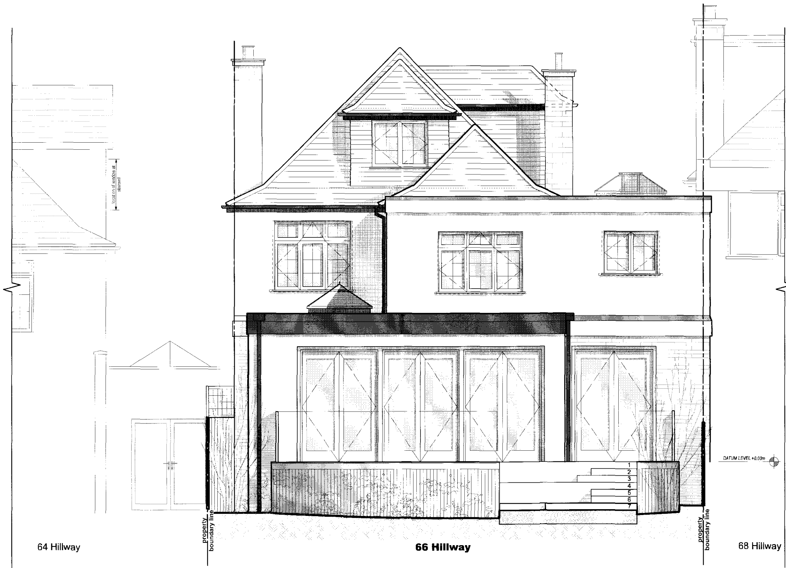
rear (east) elevation: approved