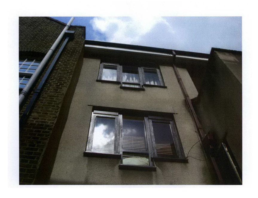
Photo 3 - View to rear of 51-53 Neal Street –Residential kitchen Windows