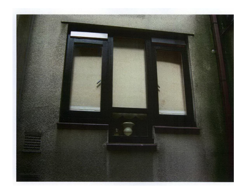
Photo 4- View to rear of 51-53 Neal Street –Residential kitchen Windows