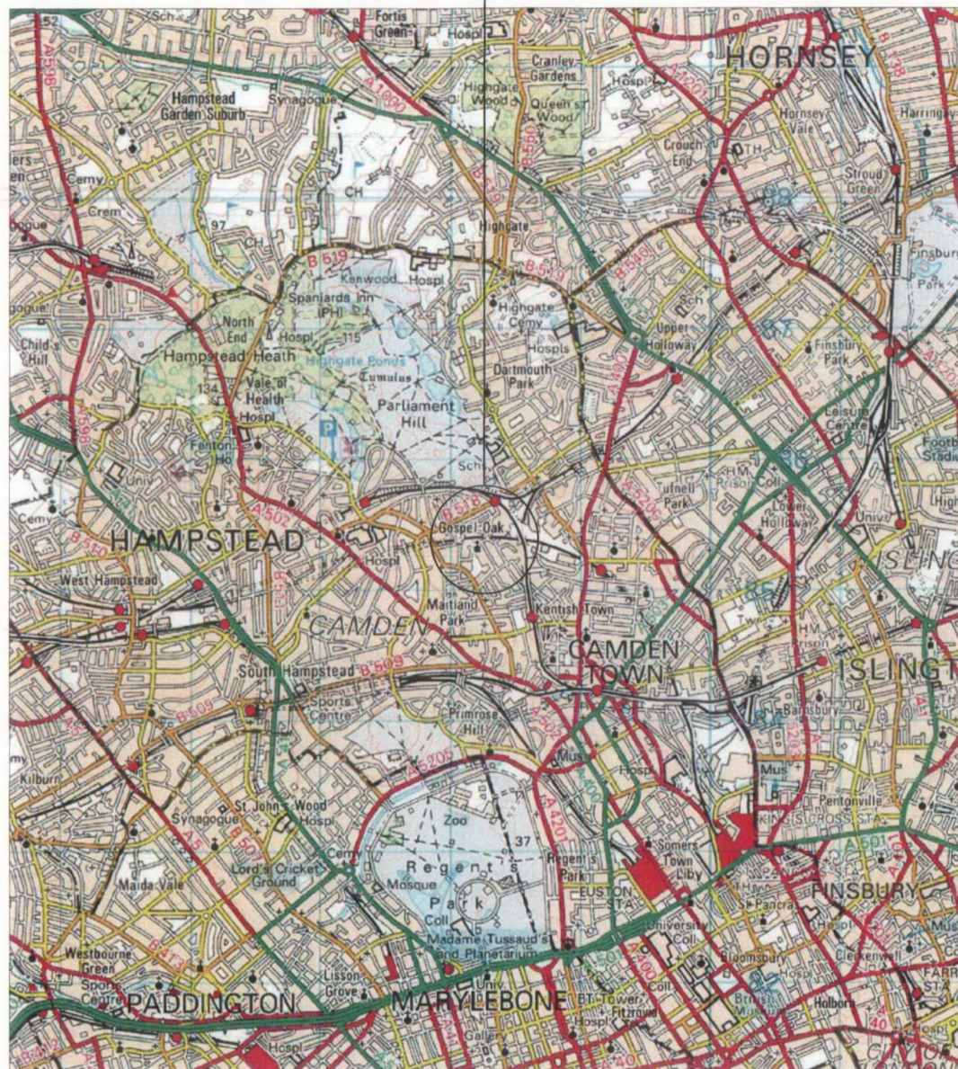
GENERAL LOCATION PLAN (Scale 1:50000)

Reproduced from the Ordnance Survey maps with permission of the Controller of H.M. Stationary Office. Crown Copyright. Mono Consultants Limited licence no. ES100017753 Promap licence no. A152065A0001