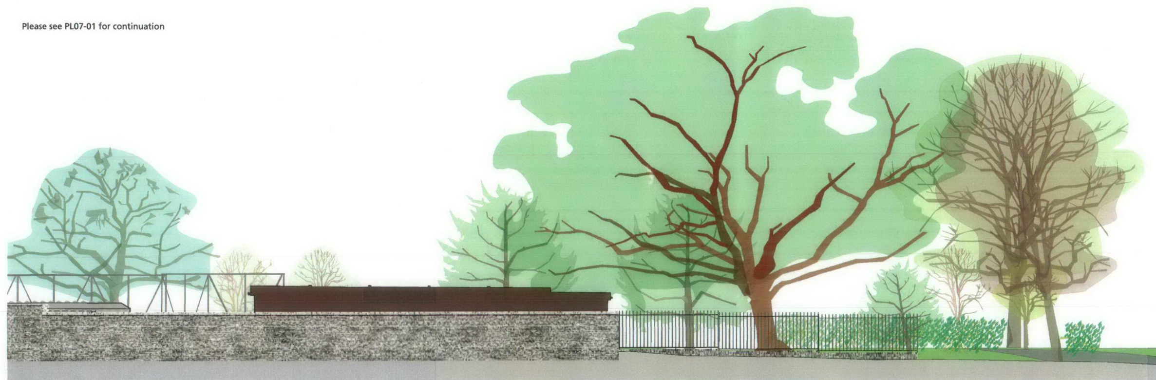
01 existing section 1:100

tip of lime tree ca +12500mm estimated height of terrace on Messina Avenue ca +11500mm finished g.f. internal level existing & proposed ±0.00 (±39.90 datum level) tip of sycamore ca +12000mm tip of large yew ca +10000mm