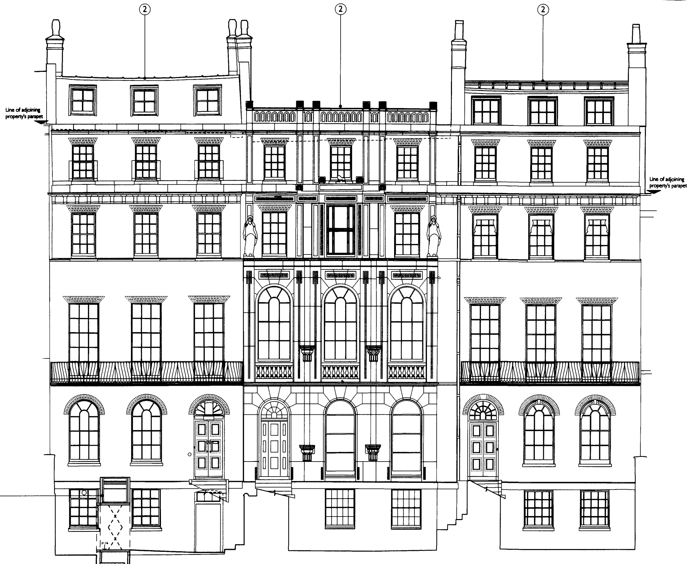
SOUTH ELEVATION (INCLUDING BASEMENT LEVEL)