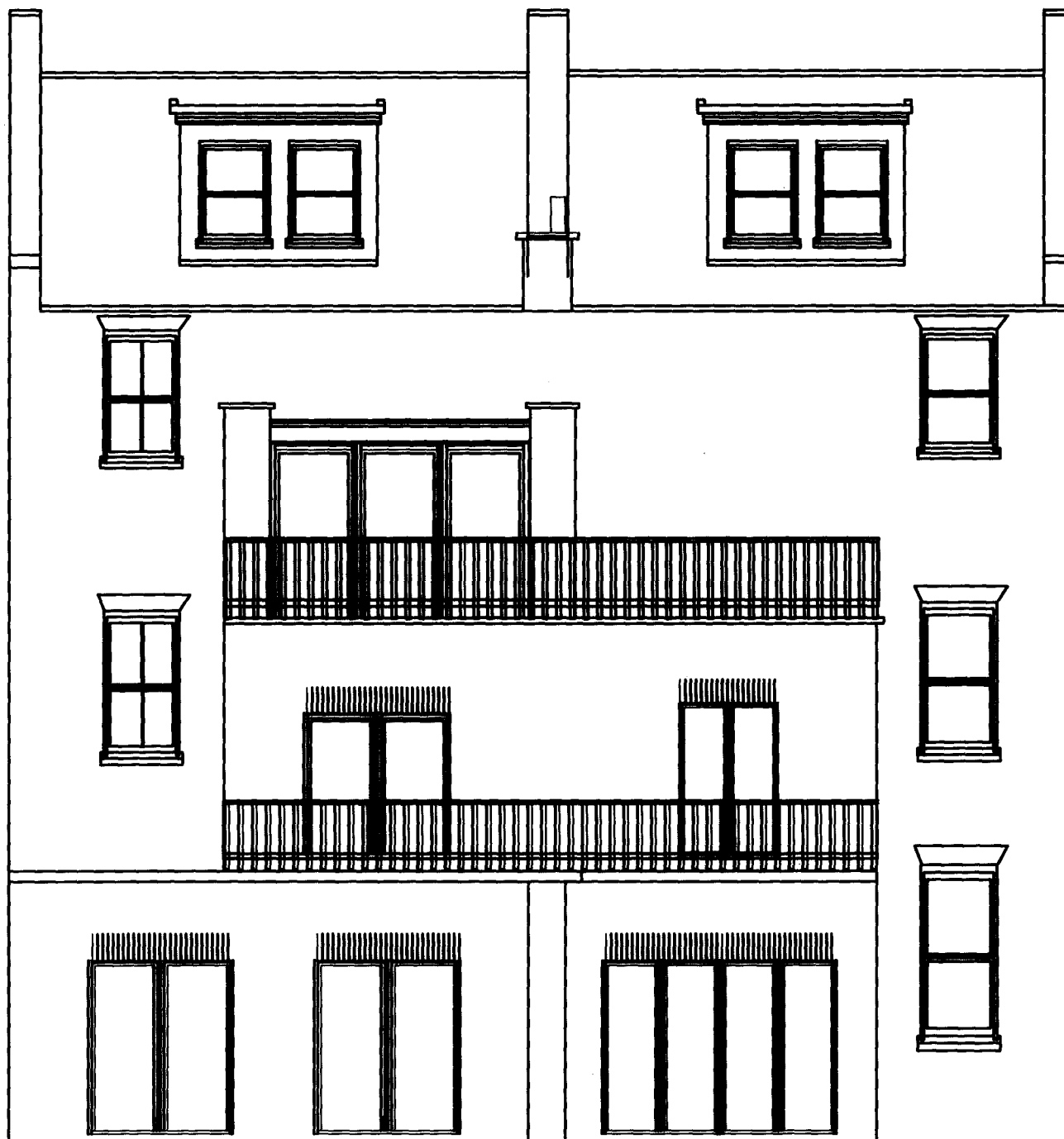
REAR ELEVATION A EXISTING No 68)