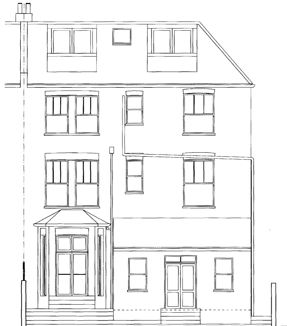
1 Rear Elevation 1:100