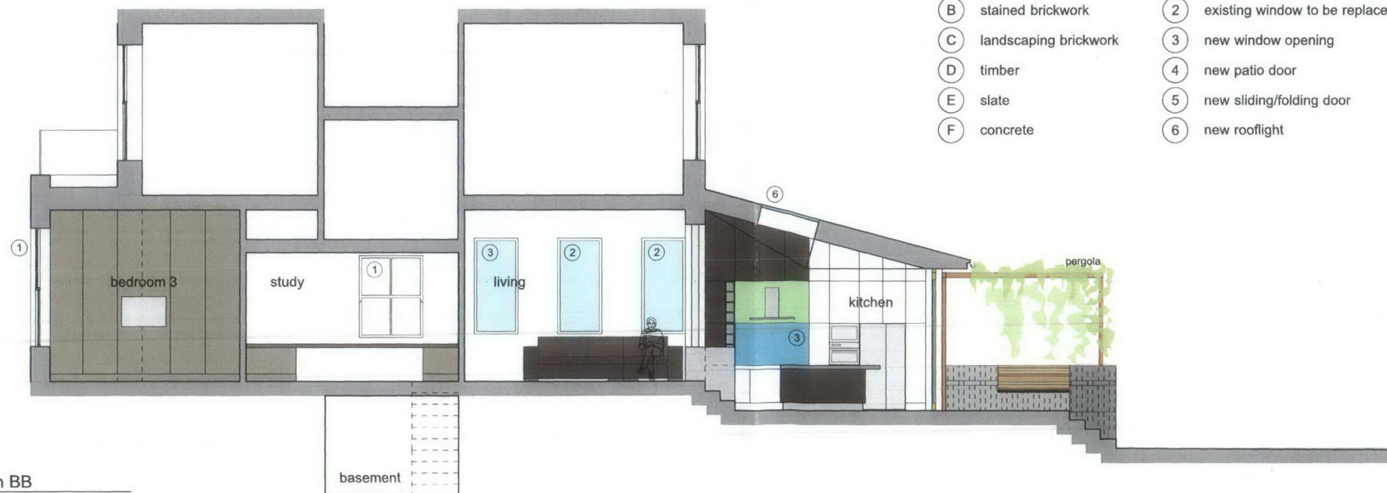
2 Section BB 1:100