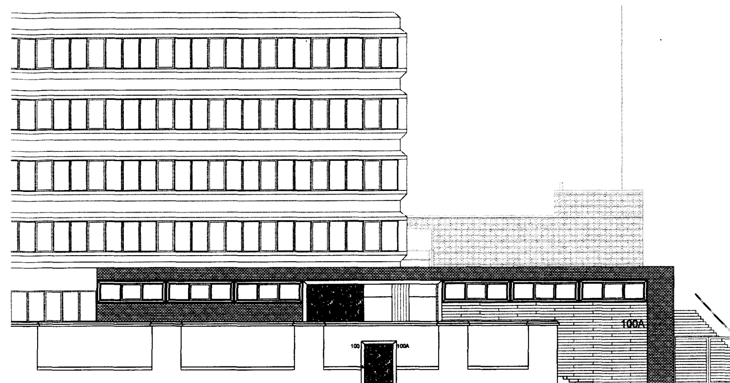
North Elevation Chalk Farm Road