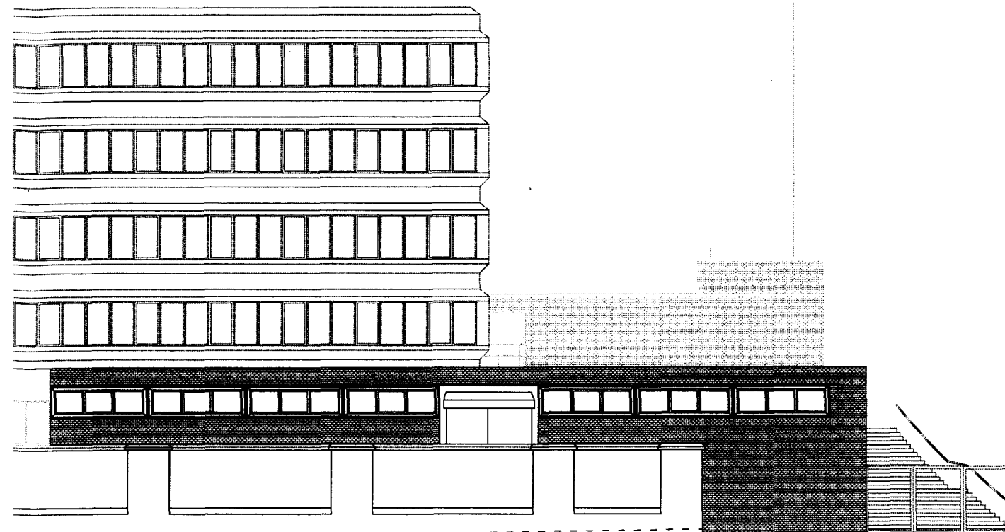
North Elevation Chalk Fam Road