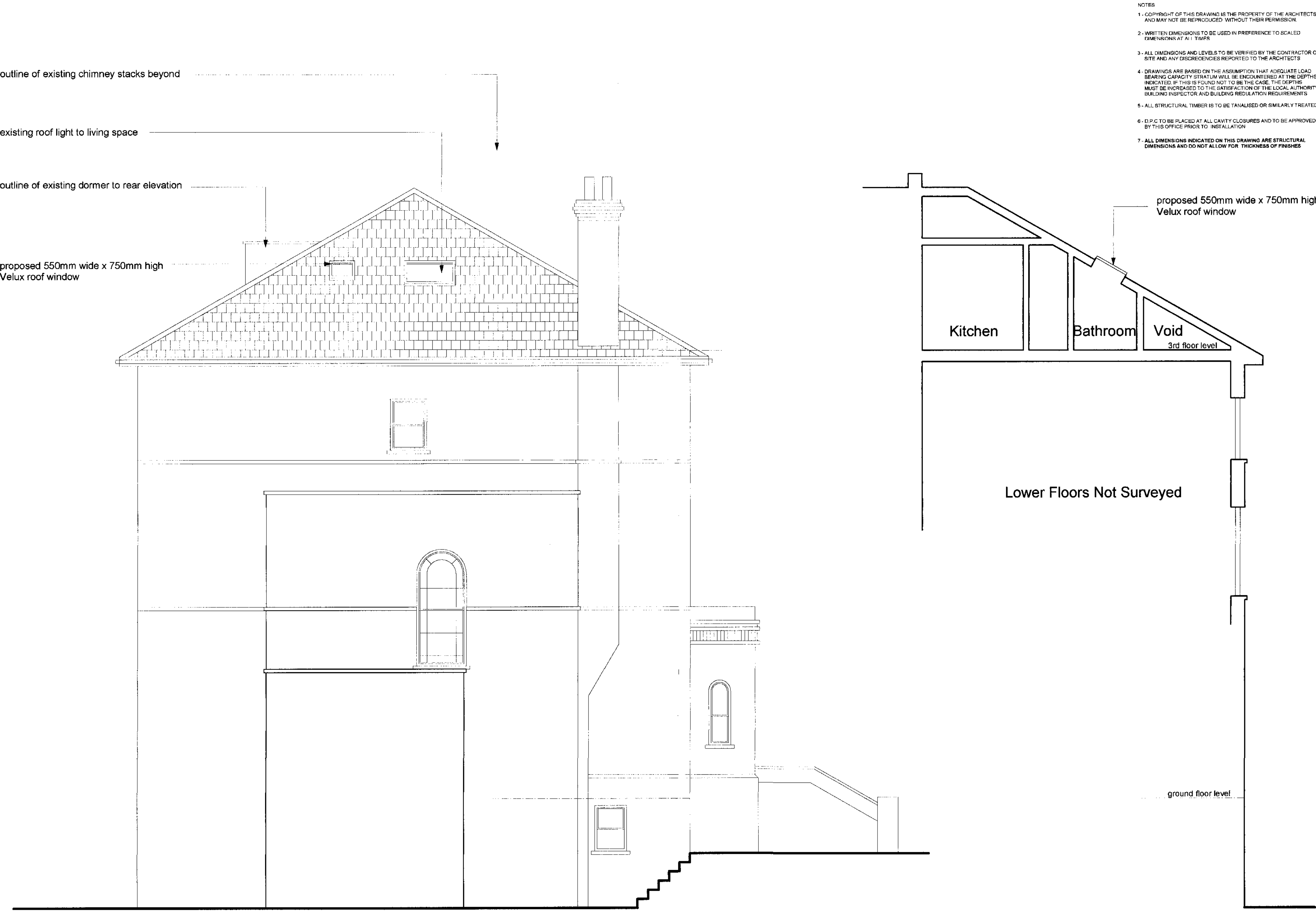
Side Elevation (looking East, facing no 121)